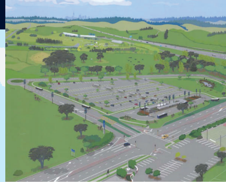
Artist's impression of Hibiscus Coast Station.