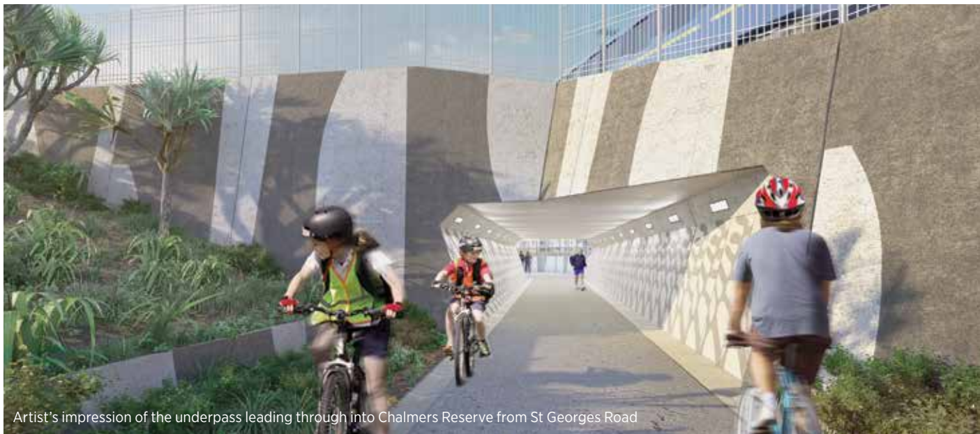
Artist's impression of the underpass leading through into Chalmers Reserve from St Georges Road