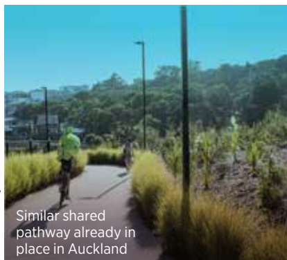
Similar shared pathway already in place in Auckland

The project started earlier in the year and now after a short hiatus thanks to the COVID-19 pandemic, we are back underway! Read on to learn a bit more about the project, what it aims to achieve and where we are up to at this stage.