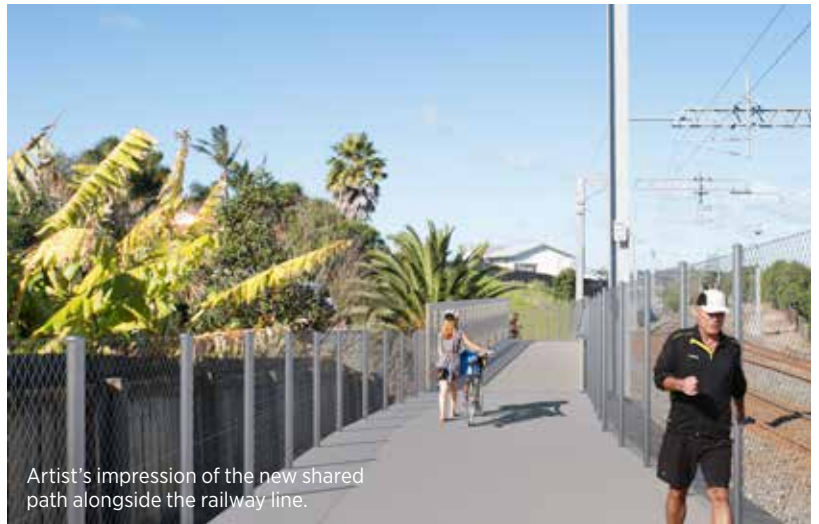
Artist's impression of the new shared path alongside the railway line.

It will also connect with the Te Whau Pathway, which follows the west side of the Whau River in Avondale, and other local walking and cycling routes.