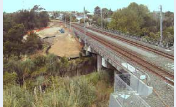
Whau Bridge: 4.00pm 12/6/2020