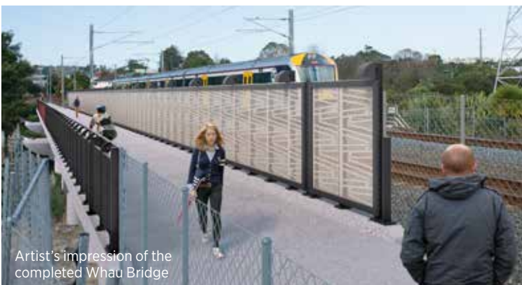
Artist's impression of the completed Whau Bridge