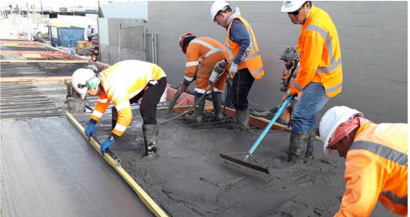
Works underway behind the New Lynn RSA on the corner of Hetana Street and Totara Avenue – undertaking the very first concrete pour as part of the Project in May 2020.