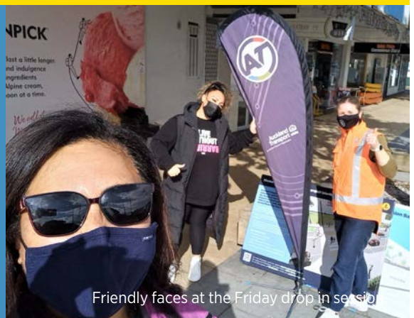
Friendly faces at the Friday drop in session

We have a fortnightly drop-in space outside Mövenpick where you can get up to date information about the project or come and chat to us. Auckland Transport and Fulton Hogan project staff will be available every second Friday to answer your queries about the works (dependent on weather and staff being well during the winter months). Our next two drop-in sessions will be held on the 12th and 26th of August from 1- 2pm. Please stop by and say hello if you are in the area at this time. We'd love to chat to you.