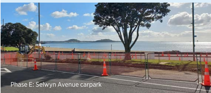
Phase E: Selwyn Avenue carpark

Most of this work will be completed during the day (between 7am - 7pm). However, please keep in mind that there are some night works required for resurfacing, line marking and speed tables later in the project, which will take place between 7pm - 5am. We will confirm those dates closer to the time.