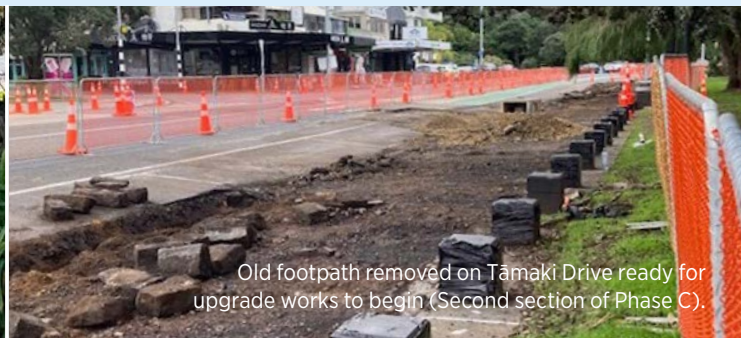
Old footpath removed on Tāmaki Drive ready for upgrade works to begin (Second section of Phase C).