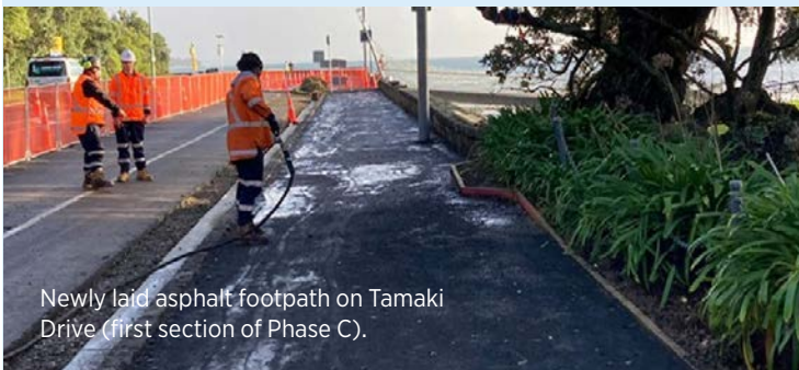
Newly laid asphalt footpath on Tamaki Drive (first section of Phase C).

We have also moved on to working on the second section of Phase C (from Atkin Ave/Tāmaki Dr intersection to the clocktower), where the old footpath has been removed. Once again, we'll be improving the footpath, building out kerbs and traffic islands, doing preliminary work on the cycleway and upgrading the existing drainage network.