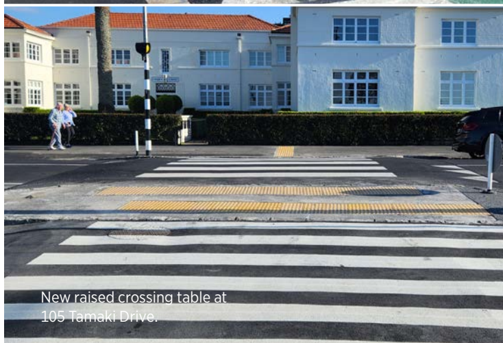
New raised crossing table at 105 Tamaki Drive.