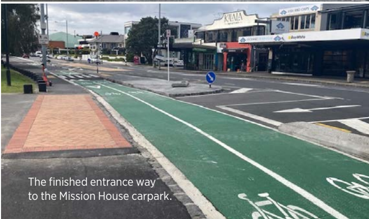
The finished entrance way to the Mission House carpark.