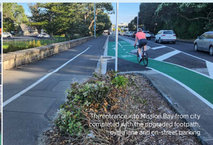
The entrance into Mission Bay from city completed with the upgraded footpath, cycle lane and on-street parking