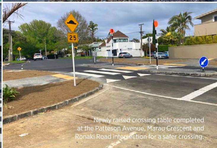
Newly raised crossing table completed at the Patteson Avenue, Marau Crescent and Ronaki Road intersection for a safer crossing.