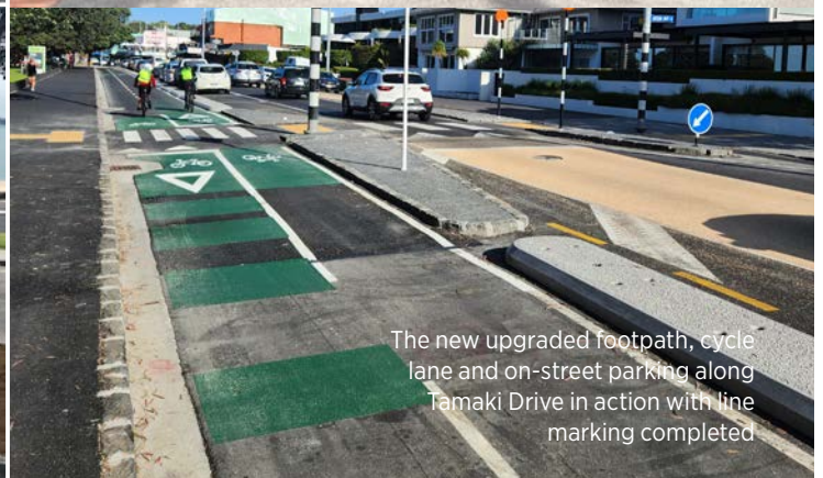
The new upgraded footpath, cycle lane and on-street parking along Tamaki Drive in action with line marking completed