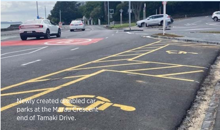
Newly created disabled car parks at the Marau Crescent end of Tamaki Drive.