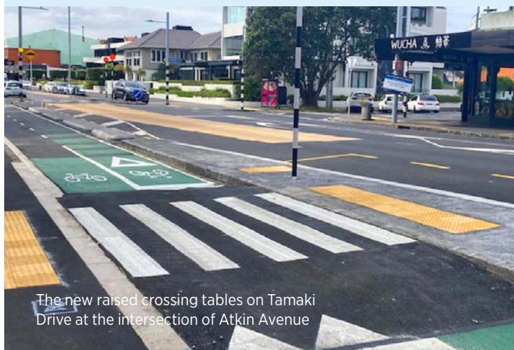
The new raised crossing tables on Tamaki Drive at the intersection of Atkin Avenue

intersection upgrade works). Our new bus shelter installation has been completed and we also finished the crossing on Patteson Avenue and Marau Crescent making it safer for people to cross and slow down traffic approaching and leaving the town centre. The majority of the Mission Bay Town Centre Safety Improvement works have now been completed. See our photos for images of the completed works.