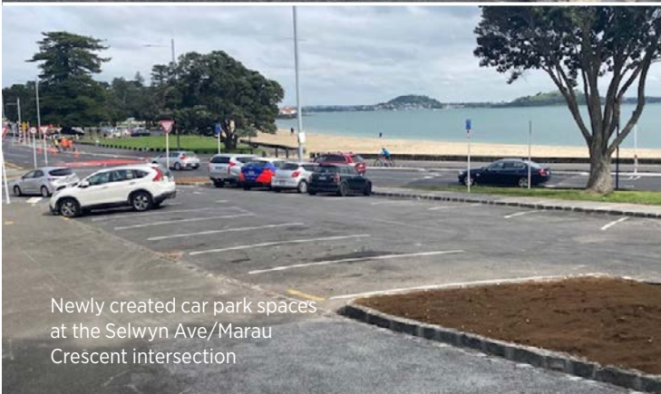
Newly created car park spaces at the Selwyn Ave/Marau Crescent intersection