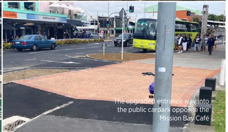
The upgraded entrance way into the public carpark opposite the Mission Bay Café