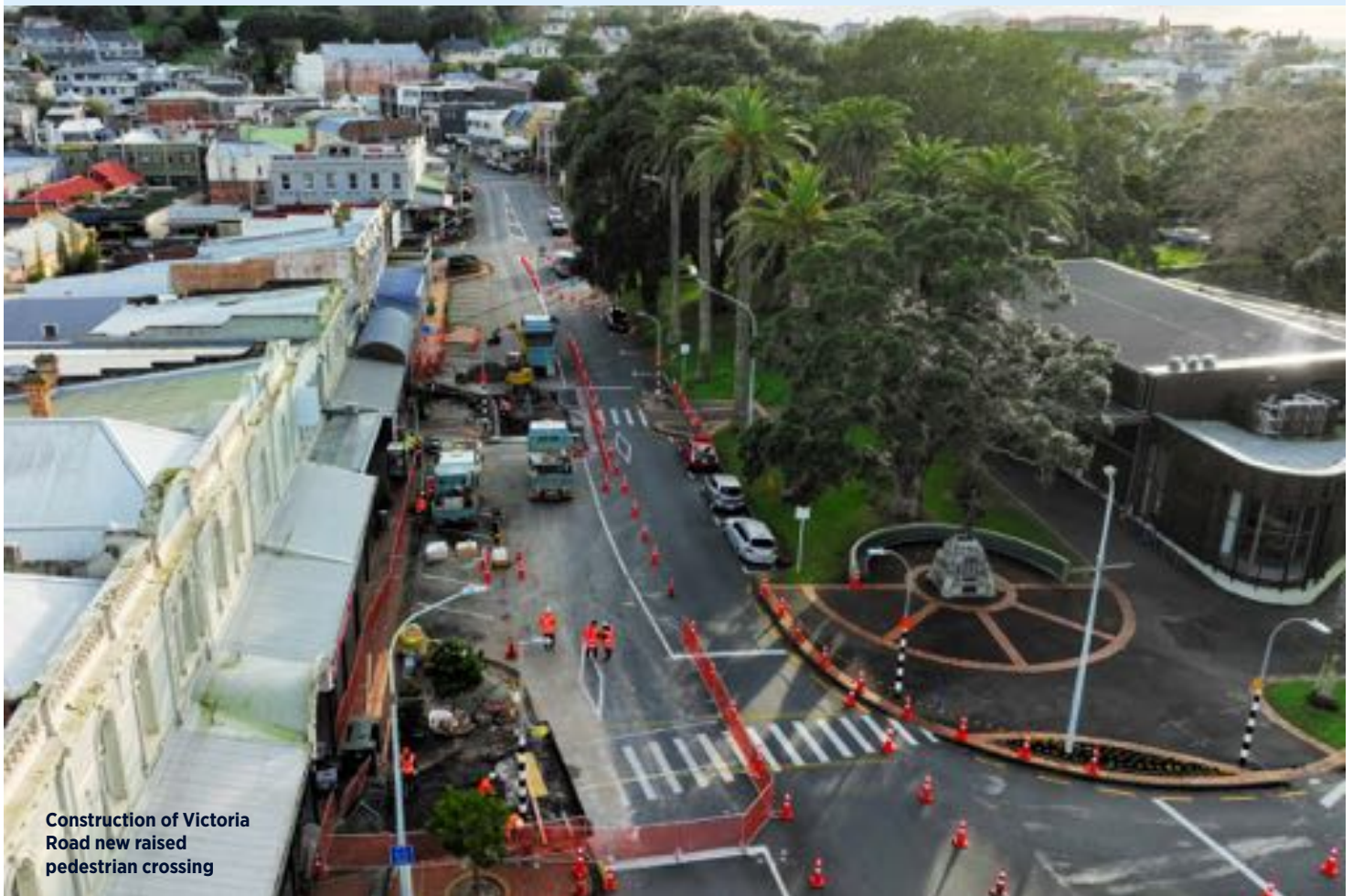
Construction of Victoria Road new raised pedestrian crossing