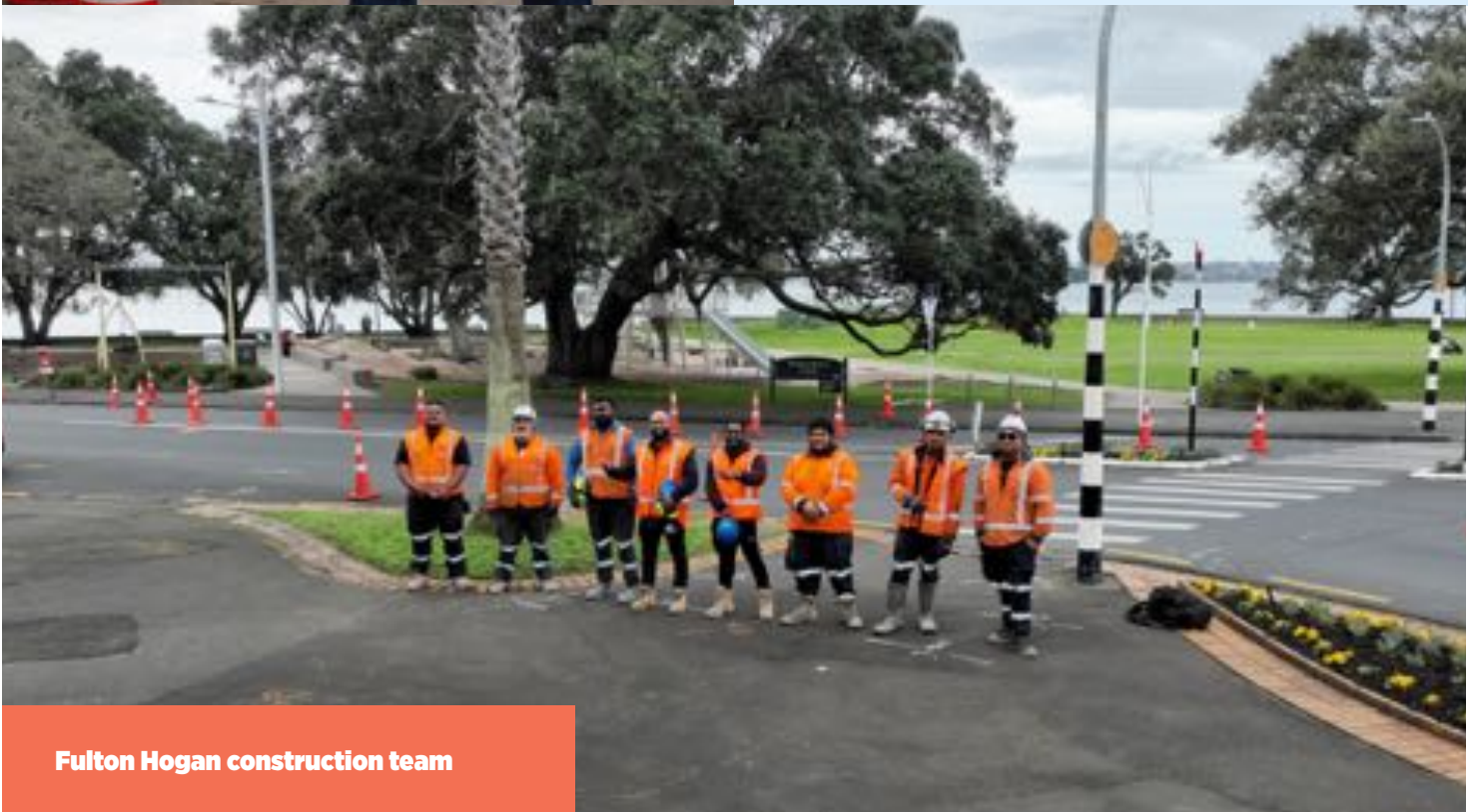
Fulton Hogan construction team