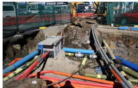
Left: Complex arrangement of underground utilities with combined services trench.

Excavation continues, with rock breaking equipment being used next to Panmure Station for the covered box the new road will run through. This is about 50% complete and is progressing well.