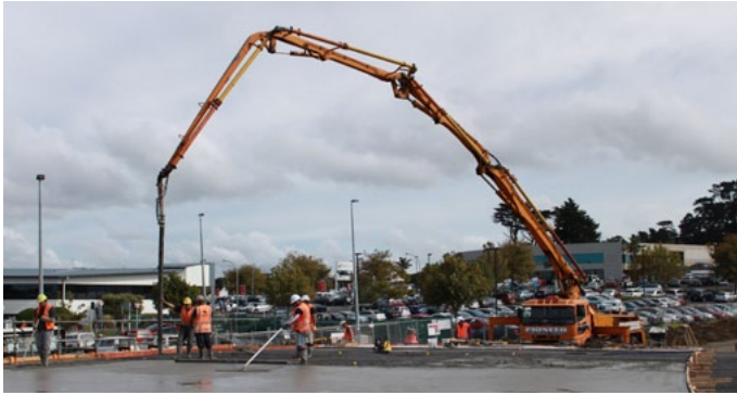
The new Mountain Road Bridge is taking shape, with the concrete now on the bridge deck.