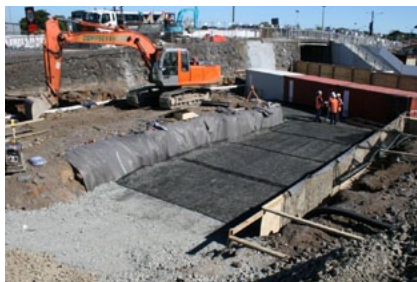
Busway bridge east abutment ready to start retaining wall.

Work is also starting on the new abutment wall approaches for the busway bridge on the east side of the railway. Work is ongoing at nights over the next week or so with Ellerslie Panmure Highway closed eastbound, to temporarily strengthen the existing bridge, so part of its abutment walls under the footpath can be removed to construct the new bridge.