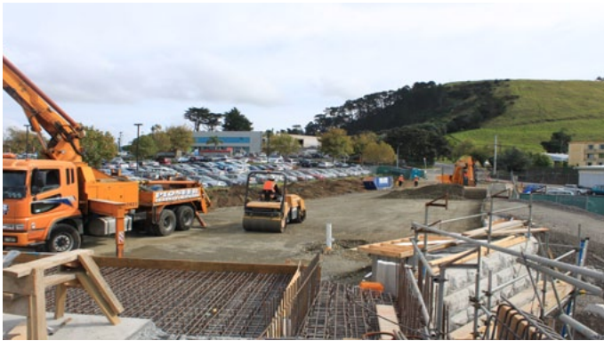
The approaches to Mountain Road Bridge are now in the process of being stabilised.