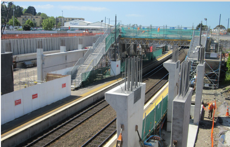
Columns for new Panmure Station building in place (foreground). Work is continuing on the architectural finishes and stairs for the pedestrian plaza in the background