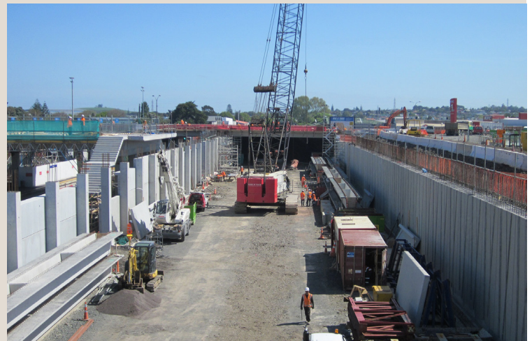
View south of tunnel showing walls in place and beams stacked ready to be lifted into place for the roof