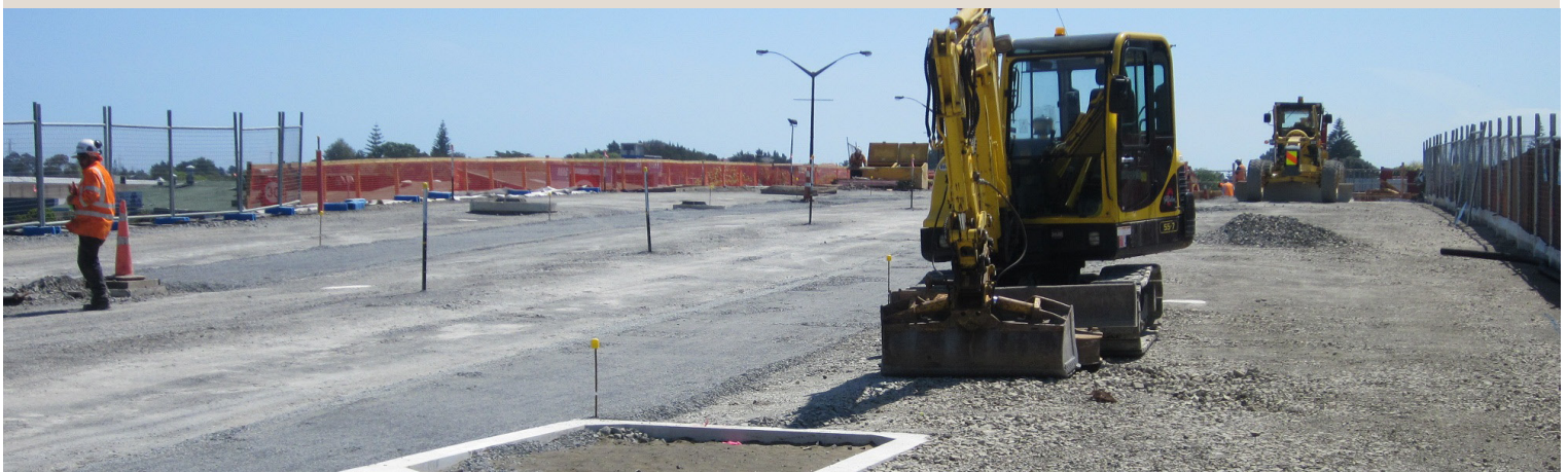
New bridge approach - road basecourse being prepared ready for asphalt to be laid next week