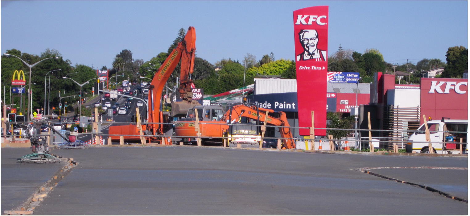
Busway bridge deck - concrete has been poured