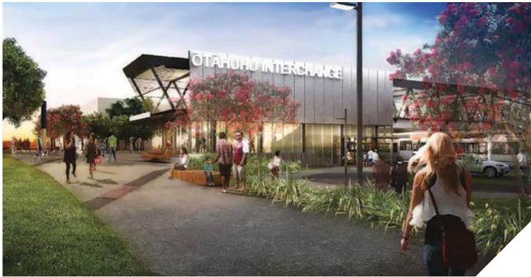
Otahuhu Interchange from Walmsley Road

Welcome to the third project update newsletter on the Otahuhu Bus Train Interchange.