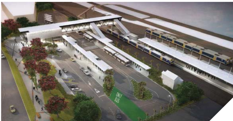
Aerial overview of Otahuhu Interchange concourse