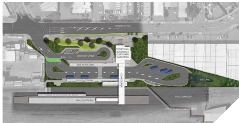
View of proposed Otahuhu Interchange