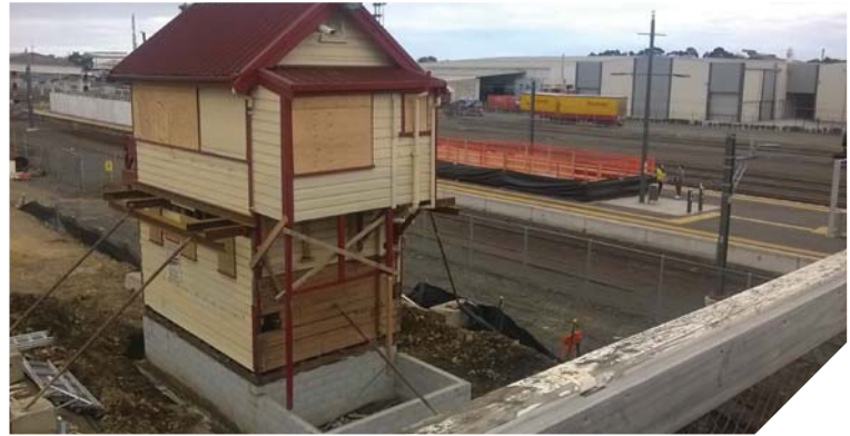
Relocating the platform signal box inside the station area