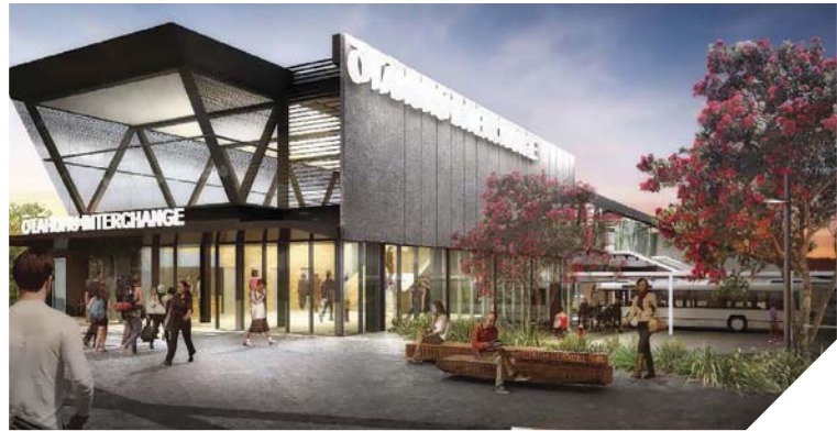
Plaza area in front of Interchange entrance