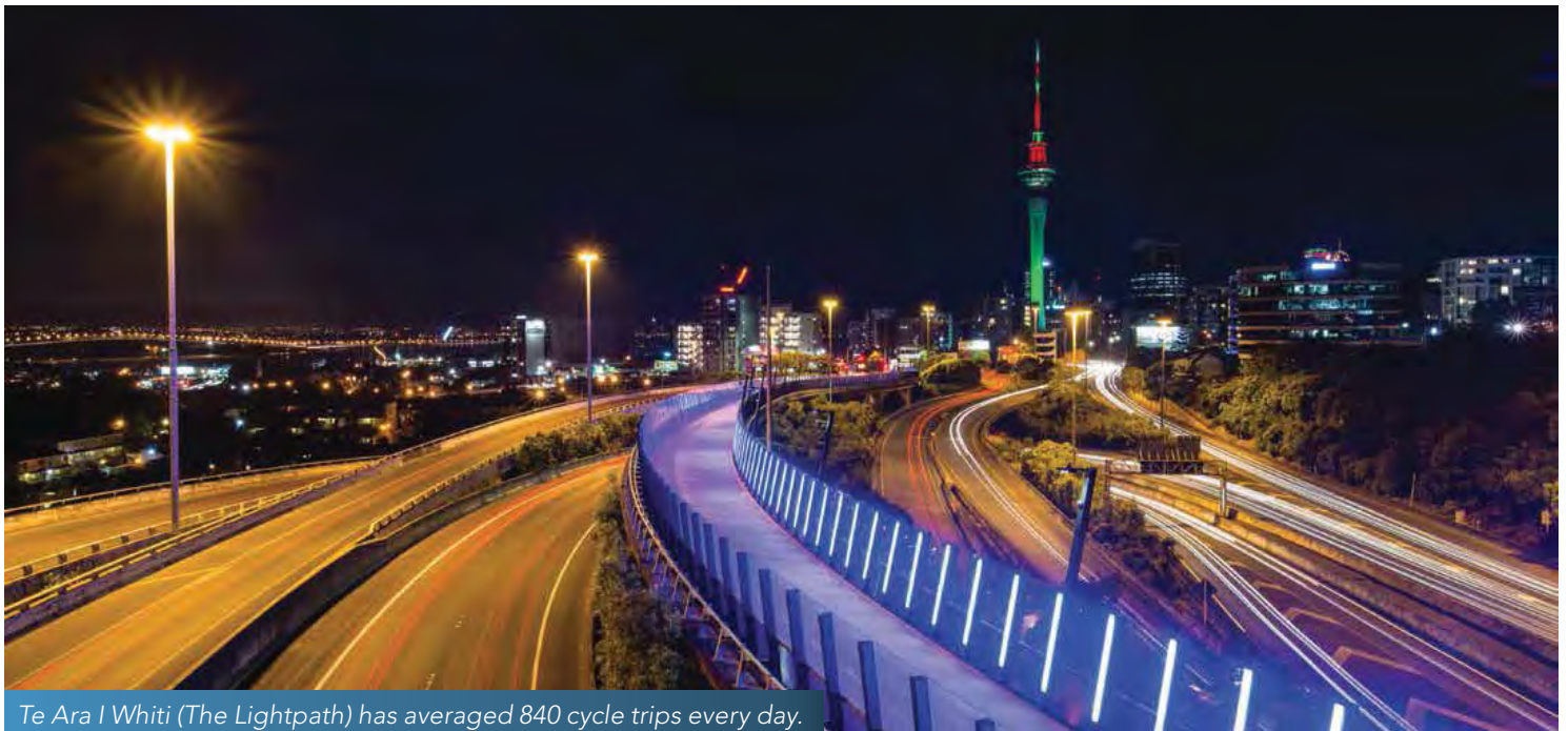
Te Ara I Whiti (The Lightpath) has averaged 840 cycle trips every day.

Funded through the Urban Cycleways programme, these new connections will provide communities along the route with improved access to the city centre for work, education and leisure.