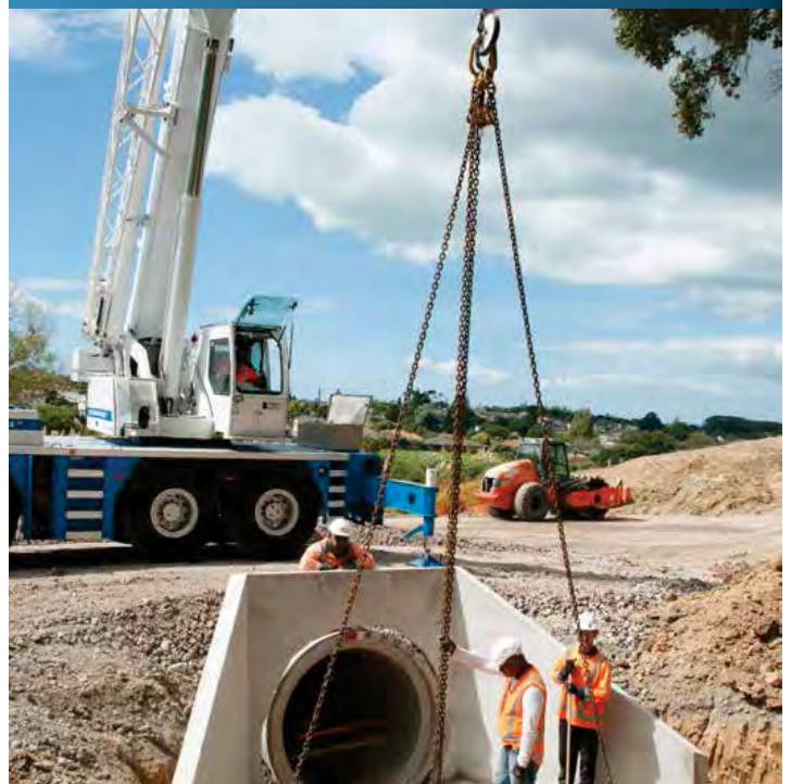
A large 1.5 metre culvert channels water underneath the path.