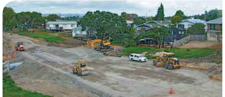
Building up an earth ramp to create a gentler slope.