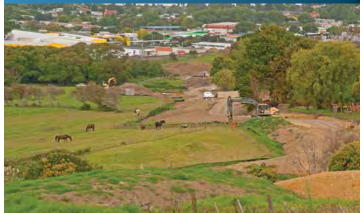
Looking along the route of section one towards Glen Innes.