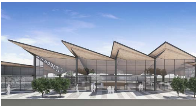
Proposed external structure along Putney Way