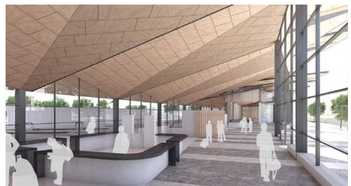
Internal view of passenger waiting area, with Putney Way to the right