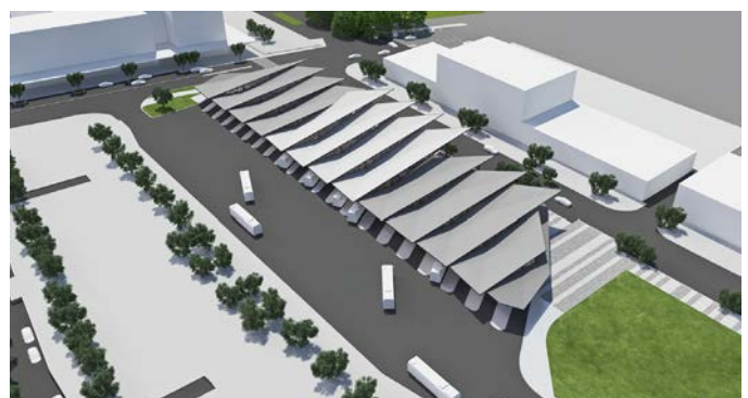
Overview of sawtooth design of the bus station