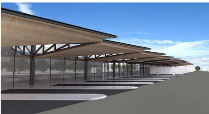
Concept design of the sawtooth layout in the bus operational area