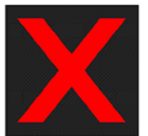
TYPICAL OVERHEAD GANTRY SIGN N.T.S