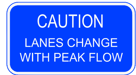
TYPICAL STATIC AND SIDE ROAD SIGNAGE N.T.S