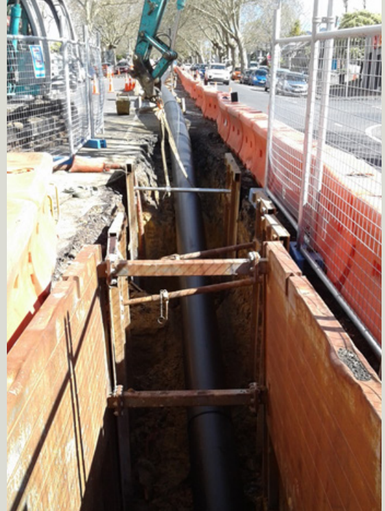
New HDPE stormwater pipe as it is being pulled in the trench.

Working in Franklin Road poses many challenges for our team and we have had to be innovative in our approach to installing new stormwater pipes in the middle of the road.