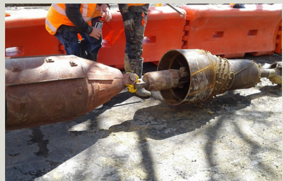
The Bursting head used to burst the existing pipe attached to the new HDPE pipe.

We are currently expecting to open access to Franklin Rd from Victoria St in early November.