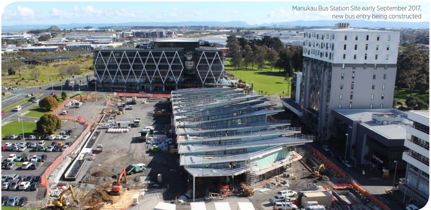
Manukau Bus Station Site early September 2017, new bus entry being constructed

Over the next two months, we will also be creating the new bus entry from Osterley Way and completing some necessary services connections. This may cause some disruption for pedestrians, but we will do what we can to minimise any inconvenience. Signs for alternative routes will be clearly displayed.