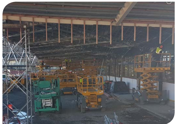
Scissor lift action. There more than 40 elevated work platforms on the site