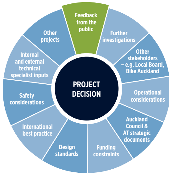
Figure 1: There are many factors to consider when deciding on a preferred option and final design.