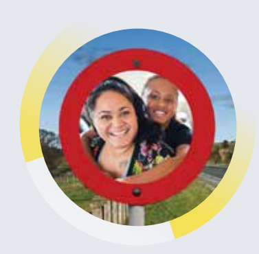
Speed Limits Bylaw came into force on 30 June.