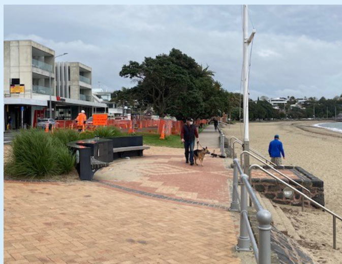
Pedestrians out enjoying the greater freedom of Level 3, while work starts back up on St Heliers safety improvements Stage 2