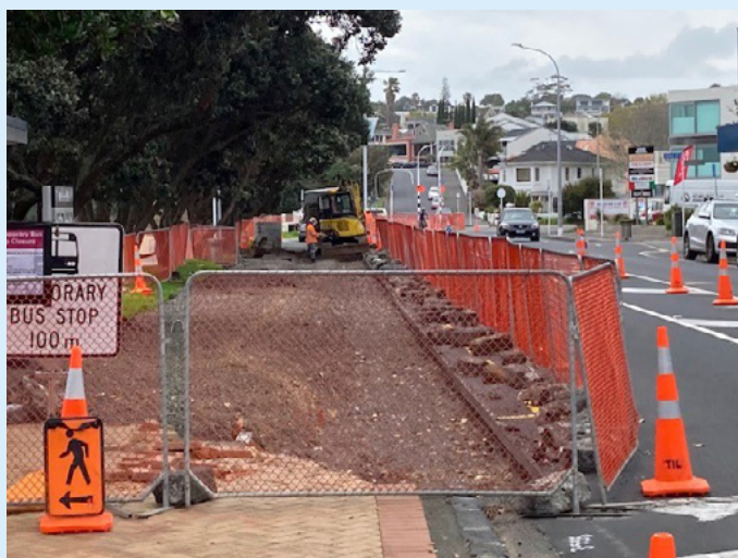
St Heliers project gets back underway at Alert Level 3

Starting back up, right where we left off, our first activities have been laying asphalt and clay pavers through Goldie Street and St Heliers Bay Road, to match the finish achieved outside the Bathing Sheds.