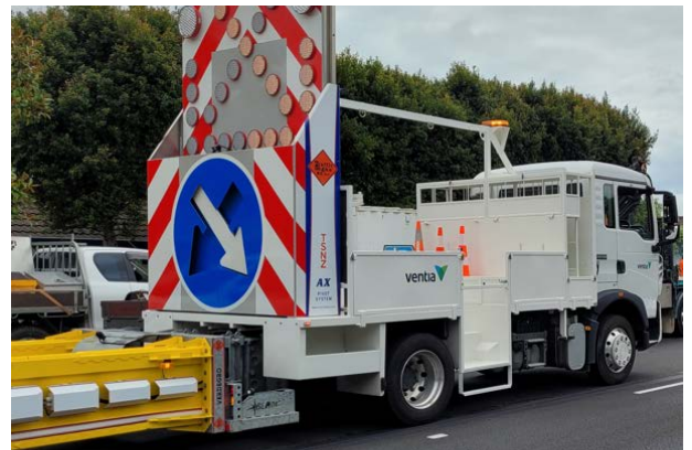
Ventia team on site

We would like to thank you for your patience while this important safety work is completed.