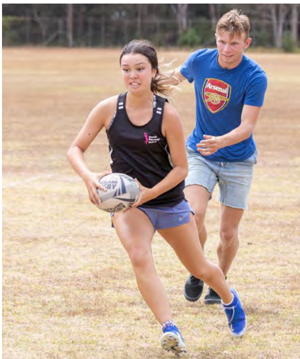
Waiheke High School students playing touch rugby.