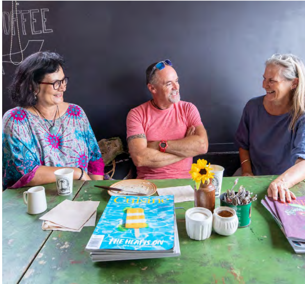
Cafe on Waiheke.

We are committed to carrying out the following key initiatives to achieve these goals, subject to post COVID-19 pandemic financial constraints.