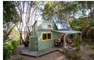
A tiny house on Waiheke.

We will focus on seven outcomes to guide our work and make Waiheke a better community for all. Our aspirations are outlined below.