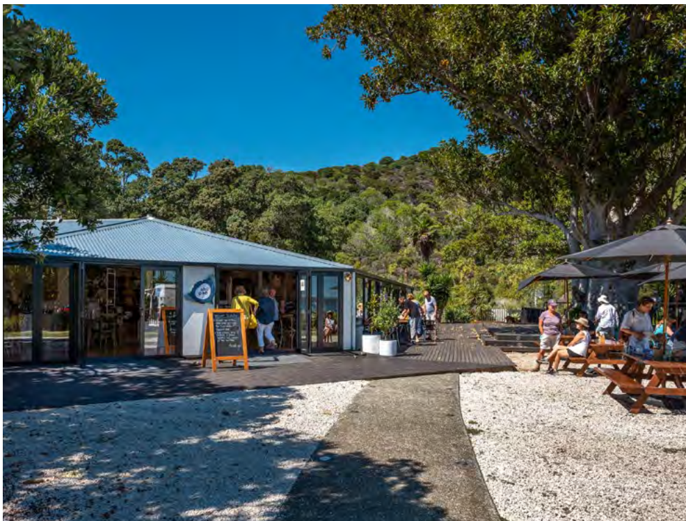
Ahipao Café and Destination Store.