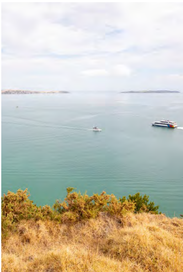
Hauraki Gulf viewed from Waiheke.