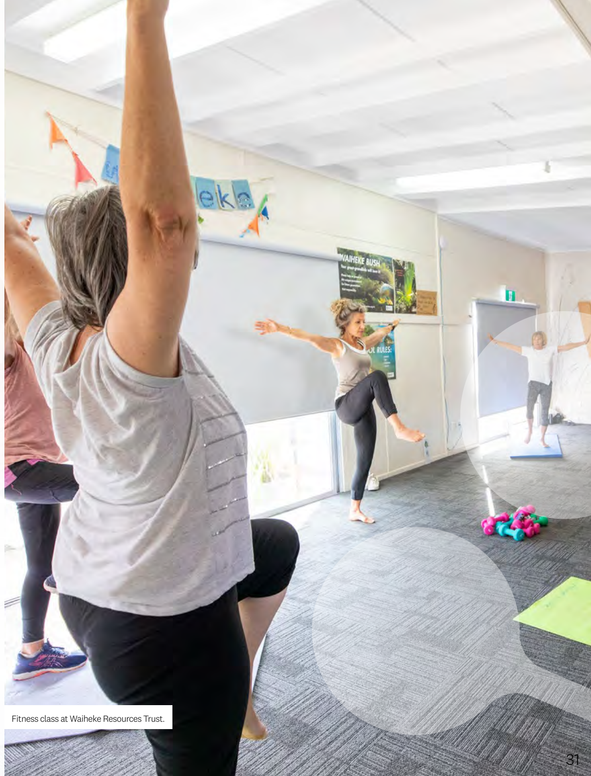
Fitness class at Waiheke Resources Trust.

“ Our facilities are very important to our community, and we will continue to look at ways to ensure their use is maximised. ”