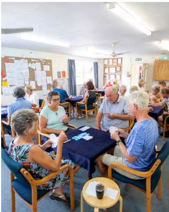
Catherine Mitchell Art Centre.