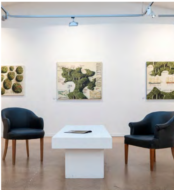
Waiheke Community Art Gallery.