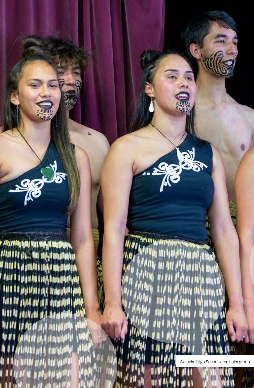
Waiheke High School kapa haka group.