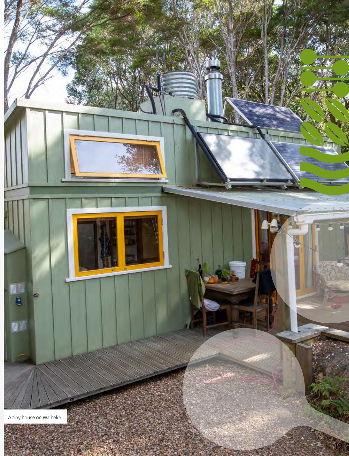
A tiny house on Waiheke.

“ We also want to ensure that Waiheke remains a water-sensitive community, with sufficient resiliency in terms of drinking water supply, and for stormwater and wastewater management systems. ”