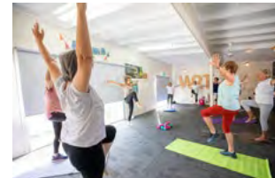
Fitness class at Waiheke Resources Trust.

We will work with and support mana whenua and mātāwaka to increase the wellbeing of all residents, with respect to Te Ao Māori.