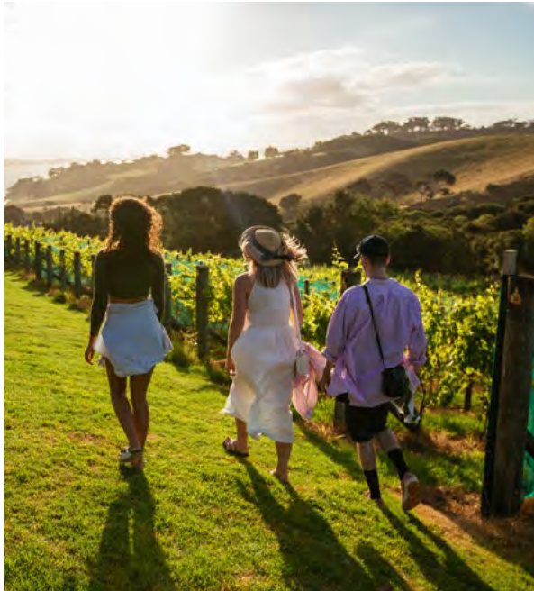
Tourists at a vineyard on Waiheke.