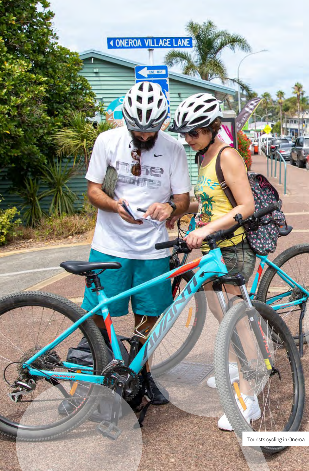
Tourists cycling in Oneroa.

Whakaotinga whitu: Te Ikiiki me ngā Hanganga