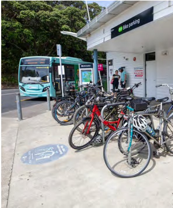
Bike parking at Matiatia ferry terminal.