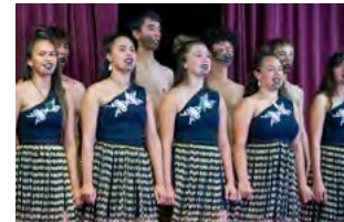
Waiheke High School kapa haka group.

Waiheke residents have a strong sense of identity and wellbeing which is enhanced through active community participation.