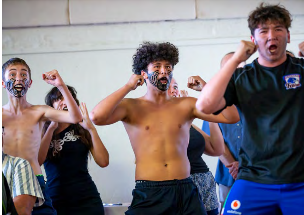
Waiheke High School kapa haka group.