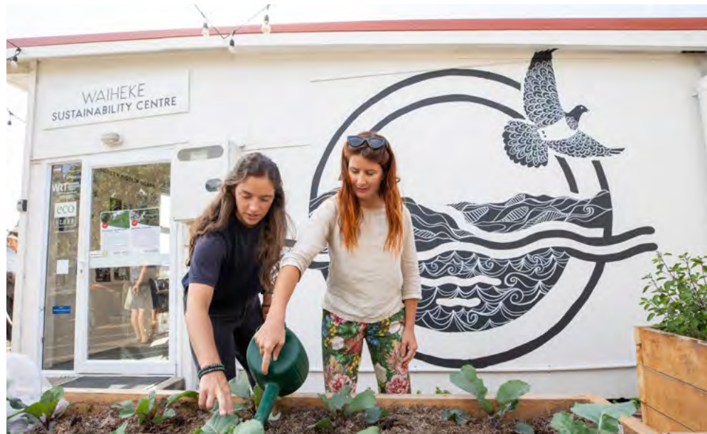
Waiheke Sustainability Centre.

Climate change is central to all local board plans and initiatives, both in terms of climate change mitigation and addressing climate change effects. We will work with our community to prepare for the future.