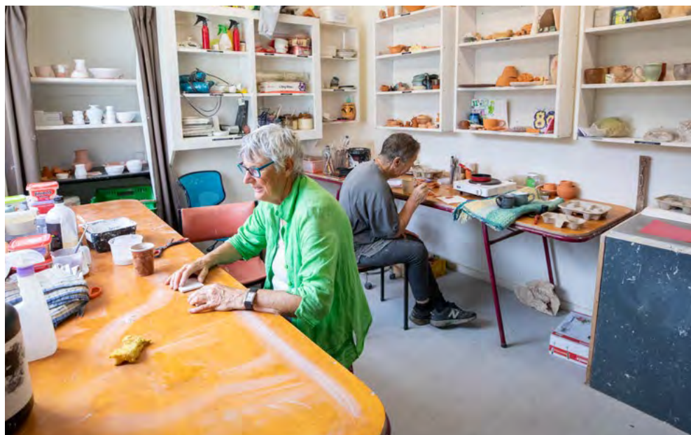
Catherine Mitchell Art Centre.