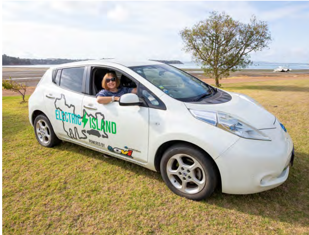
Electric Island electric vehicle.

We are committed to carrying out the following key initiatives to achieve these goals, subject to post COVID-19 pandemic financial constraints.