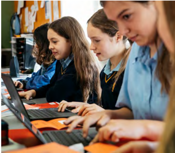
Students at Waiheke High School.