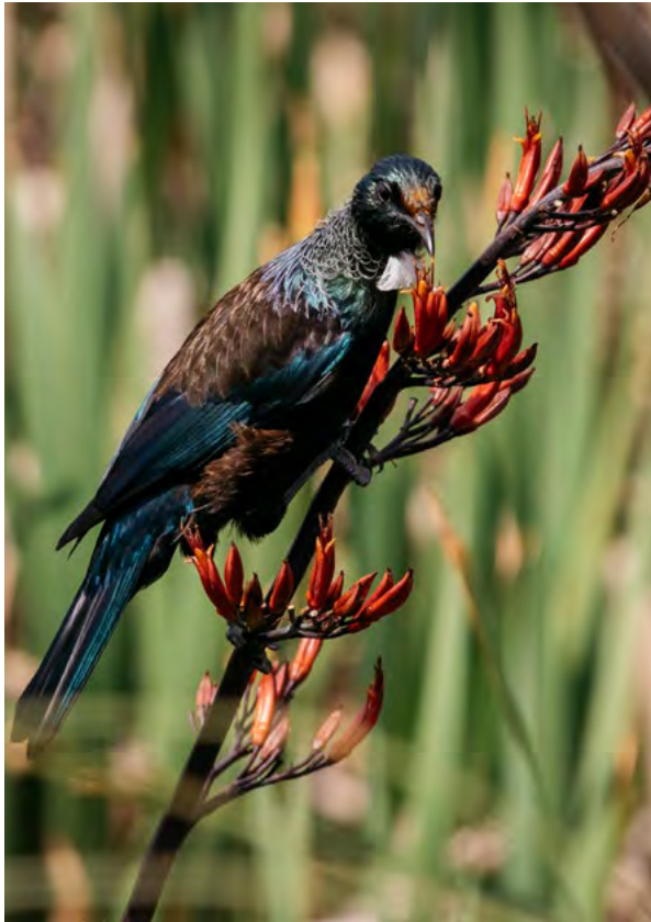
A tui on Waiheke.