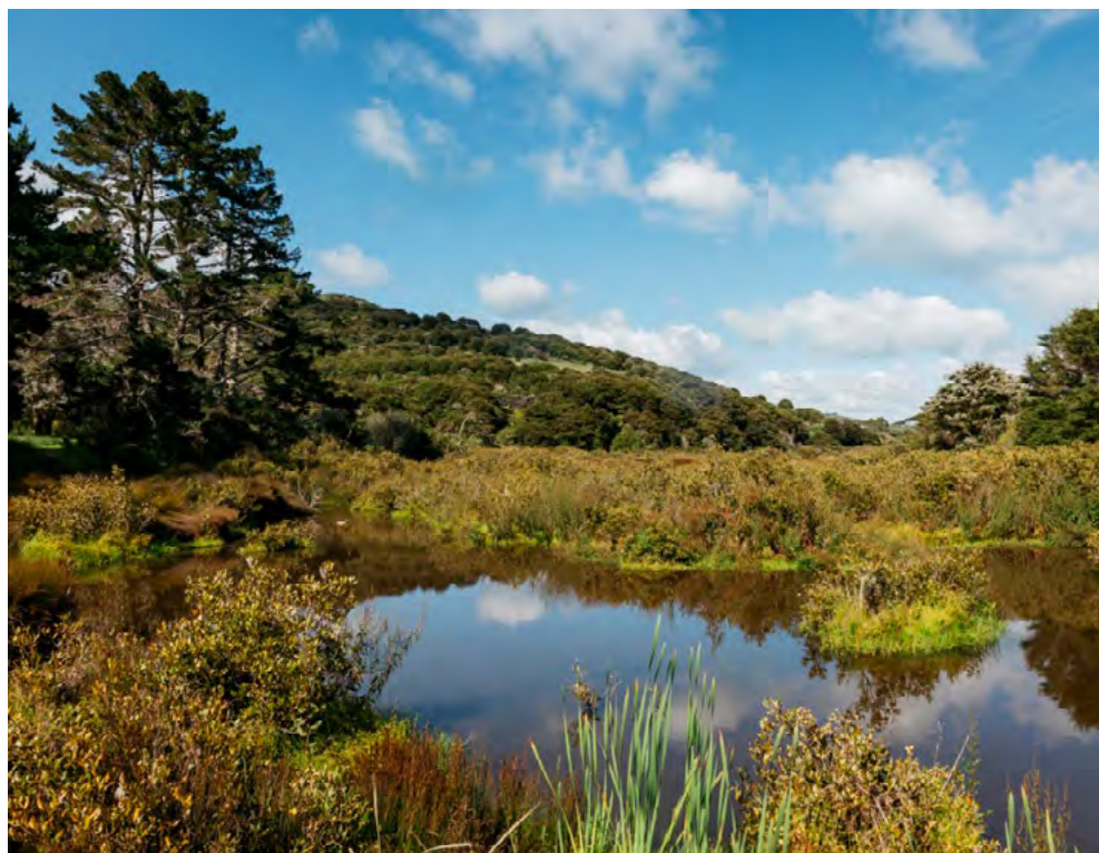
A Waiheke wetland..

We are committed to carrying out the following key initiatives to achieve these goals, subject to post COVID-19 pandemic financial constraints.