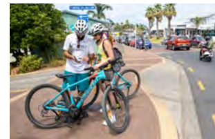
Tourists cycling in Oneroa..

Our parks, reserves and beaches are enjoyed and respected by residents and visitors. Our community, arts and cultural facilities are well used and accessible.