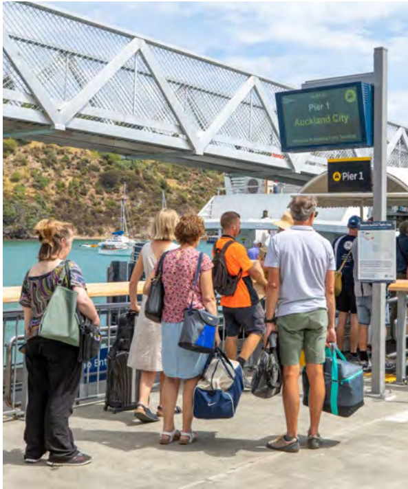
Mātīatia ferry terminal.