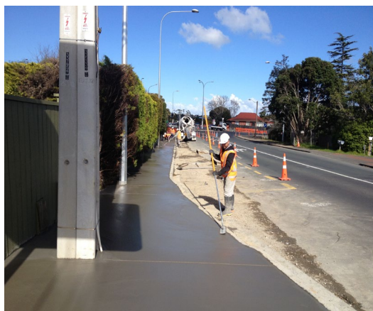
New footpath is laid on Blockhouse Bay Road (eastern side).

We are continuing to progress these works along Tiverton Road as each power pole is removed.