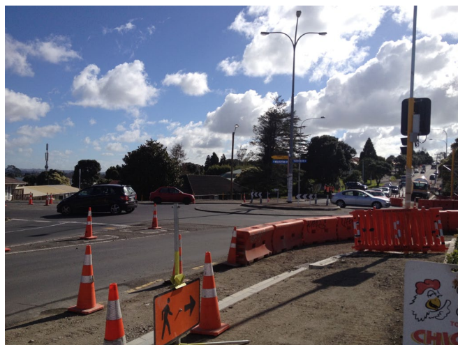
A traffic light is installed at Blockhouse Bay Road and new kerb alignment put in place for the new intersection.

Transformation of the Blockhouse Bay Road/ Tiverton Road/Wolverton Street roundabout into a signalised intersection is likely to begin in late August. After the kerbs are finished on all four corners, we will be replacing the current roundabout with a temporary one, so that we can work on each side of the intersection, one lane at a time. We will continue to keep you informed of this work.