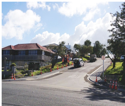
New kerbs and footpaths at Pinewood Street entrance.