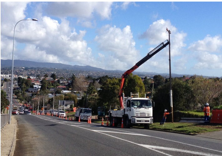
One of the last remaining powerpoles is removed from Tiverton Road

All services are now underground and we hope to have the last remaining power poles removed this next week. This milestone for the Tiverton-Wolverton Upgrade marks the end of a great collaborative effort by many organisations. We have all been working hard for the last 12 months to deliver your 'future-proofed' service upgrade in time for the next phase of road works.