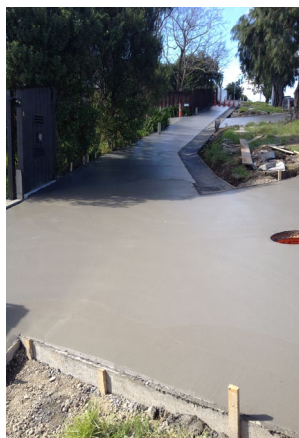
Driveway entrances and footpaths on Tiverton Road.