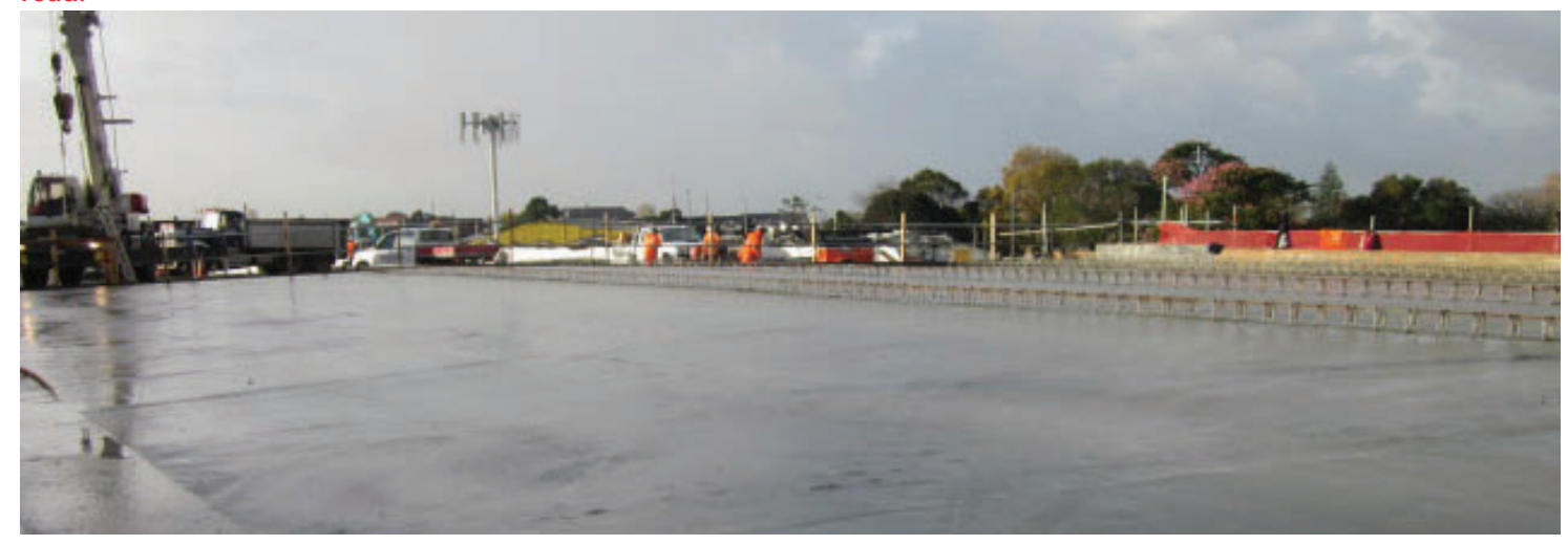
Photo centre: Ellerslie Panmure Highway bridge deck pour completed.