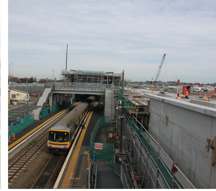
Photo top left: Excavation has started for the AMETI link road south of Ellerslie-Panmure Highway, with a large new communications cabling at Panmure Station.