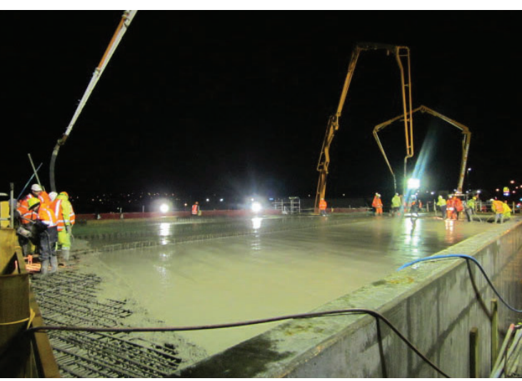
Photo bottom left: Concrete deck poured for the new Ellerslie Panmure Highway bridge.