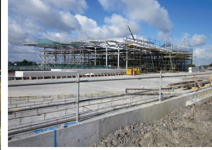
Photo bottom right: The new station building wrapped in temporary scaffolding whilst work takes place on the roof. The new local road and planter boxes are visible in the foreground.