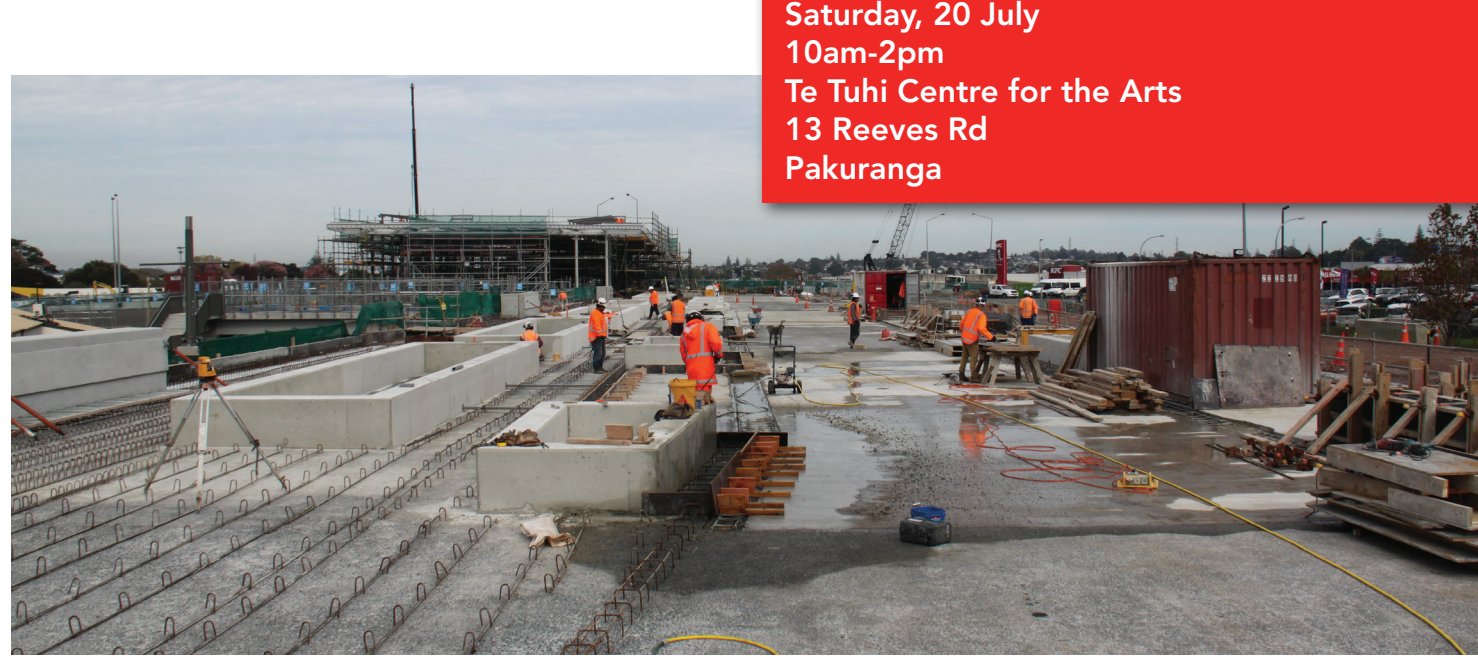
Above: Construction of new AMETI local road on top of tunnel to be used as an interchange for easy transfers between trains and buses with new Panmure Station in background.