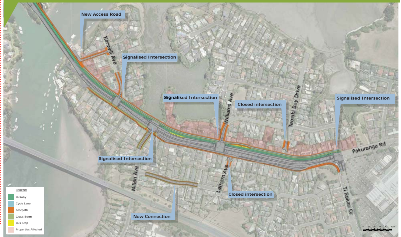
Pakuranga new road layout

What do you think about the proposed access changes across to Pakuranga Rd?