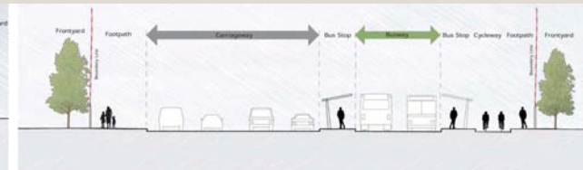
Typical without service/slip lane