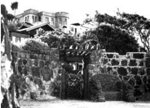
Giant's Chair.

Walk across Thorne Bay. Local residents in the 1930s-40s clubbed together to form concrete footpaths over some of the rougher surfaces. You will see natural drains flowing from Lake Pupuke into the sea. You can reach the main road from any of the side streets or continue along the rocks (be prepared to climb over rocks) to see the Fossil Forest.