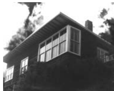
University of Auckland School of Architecture library collection, 1942.

Built in the 1940s on a steep site overlooking Black Rock. It was designed by architect Vernon Brown who was one of the first to grapple with designing buildings that respond to New Zealand living conditions and explore a distinctly New Zealand style of architecture. This house is a superb example of his philosophies. Low single pitched roof, dark creosote boards and tall double hung sash windows, were hallmarks of his style. Together they form a simple shed-like building that perches precariously on the shore and opens out to the sea and towards Rangitoto.