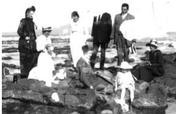
Picnic on the rocks, early 1900s.

At low tide the remnants of 500 tree stumps can be seen on the reef by the boat ramp. These tree moulds formed when fluid lava congealed around standing trees. Most of the lava then flowed away, leaving isolated stumps of basalt where the trees once stood. It is New Zealand's only example of a fossil forest.