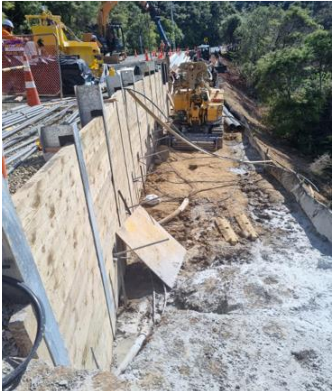
Leigh Road, Leigh