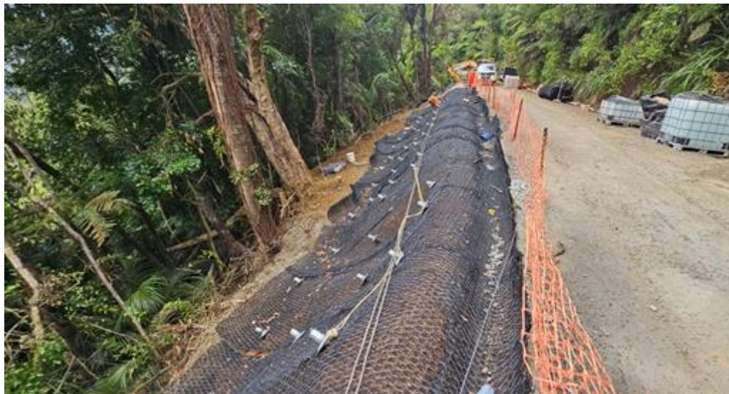
Site RP0.899 Mountain Road – image shows the soil nails that have been installed in January.