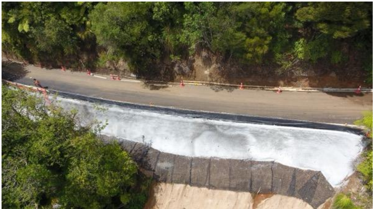
Site RP1.387 Mountain Road – image shows work on the kerb and channels.