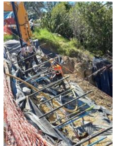
Slip on Taunton Terrace opposite #45