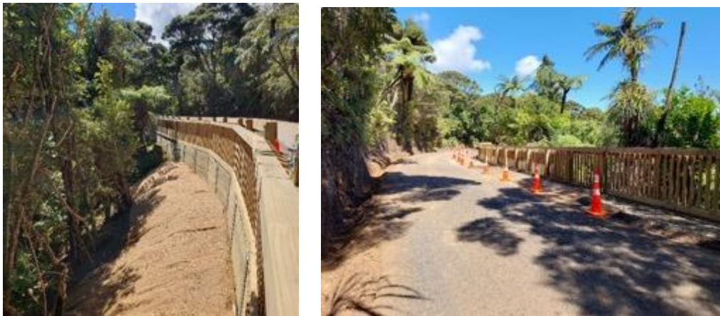
Slip site RP2.5 Lone Kauri Road, works started 15 January 2025. The handrail in the photo is above a retaining wall built prior to the cyclone. The retaining wall will be extended either side of this location.