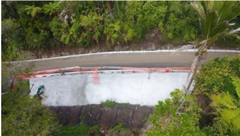
Site RP1.387 Mountain Road in February 2025