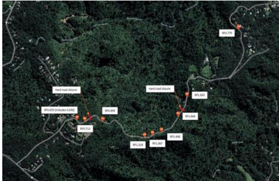
Map of Mountain Road site locations