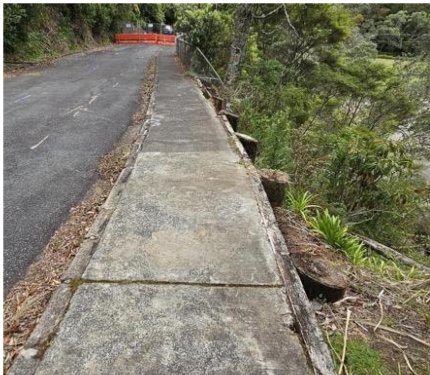
Large Slip on the corner of Paturoa Road, previous retaining wall has failed and fallen towards the beach.

An existing timber pole retaining wall adjacent to the large slip is also failing and needs to be repaired as it is at the end of its lifecycle. This work will take place after the first wall is completed.