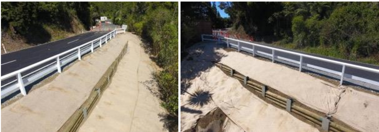
Scenic Drive RP6.73 site – the permanent retaining wall and works completed.