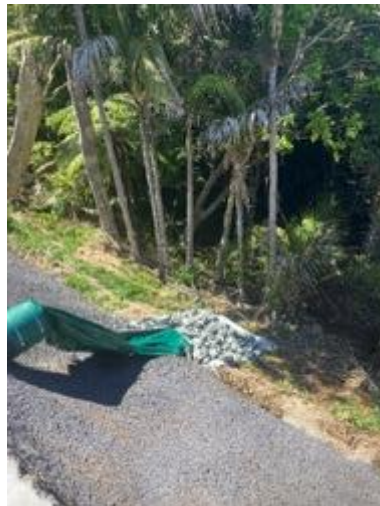
Wairere Road slip site 349 Wairere Road, sight rail and drainage aprons installed.