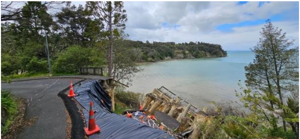
Large Slip on the corner of Paturoa Road, previous retaining wall has failed and slipped towards the beach.

An existing timber pole retaining wall adjacent to the large slip is also failing and needs to be repaired as it is at the end of its lifecycle. This work will take place after the first wall is completed.