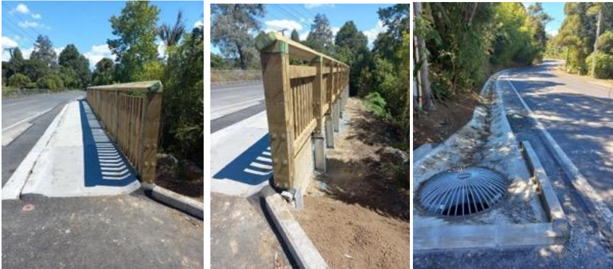
Slip located at 81 Huia Road, repair includes retaining wall and extensive drainage repairs.