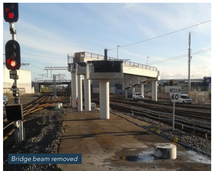
Bridge beam removed