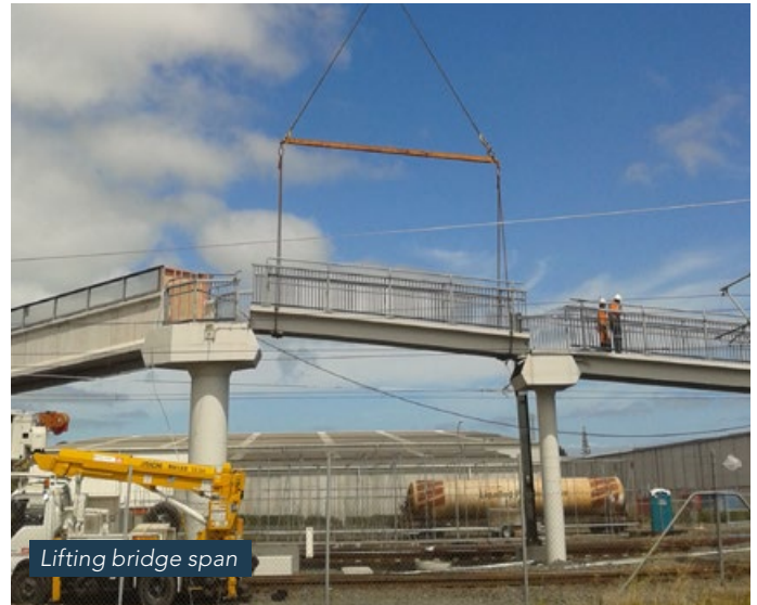
Lifting bridge span