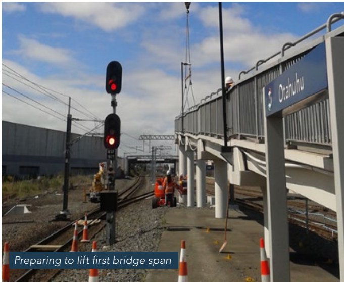
Preparing to lift first bridge span