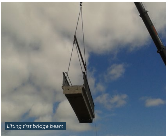
Lifting first bridge beam