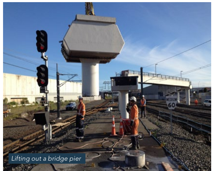
Lifting out a bridge pier