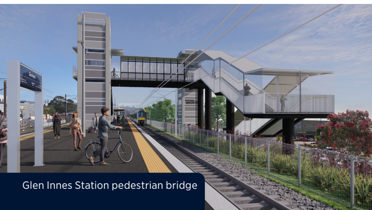
Glen Innes Station pedestrian bridge