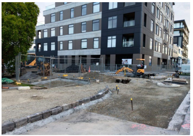
Base layers of the side road entry treatment at Northland St. Can you see the new tree pit on the corner of Northland St?

You'll also see our crews removing some trees along the Great North Road within the project area. This is where we are relocating bus stops or making changes around intersections.