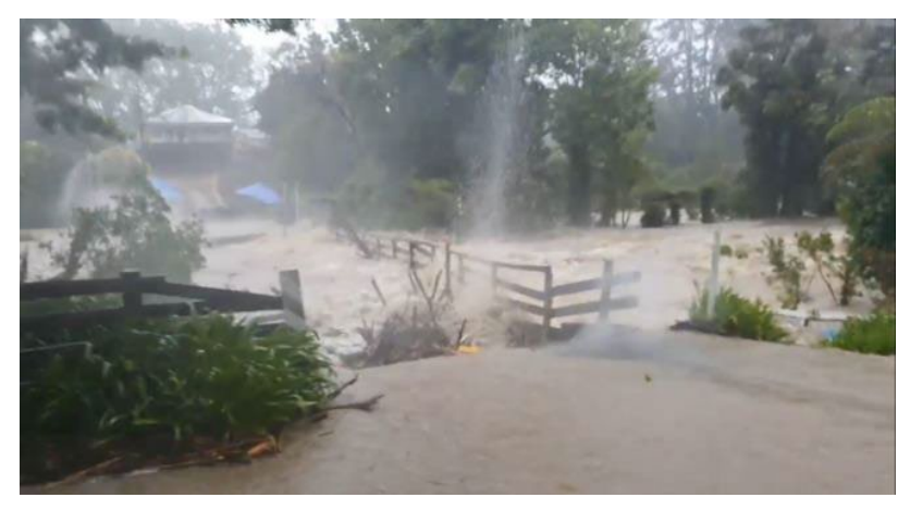
Figure 3 – Impact of flooding on the bridge

As an emergency work, AT commissioned a Bailey Bridge to be constructed in the same location, to provide temporary access to the Mill Flat Road community, while a permanent solution is investigated. The Bailey Bridge was opened to the public on Monday 06 February 2023.