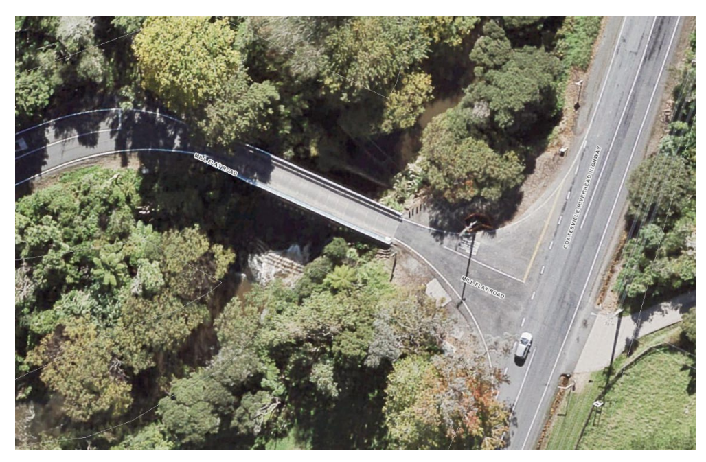
Figure 2 – Project study area

On Friday 27 January 2023, the bridge was washed away due to flooding of Rangitopuni Stream, during a significant rainfall event. The community was cut off from the road network,