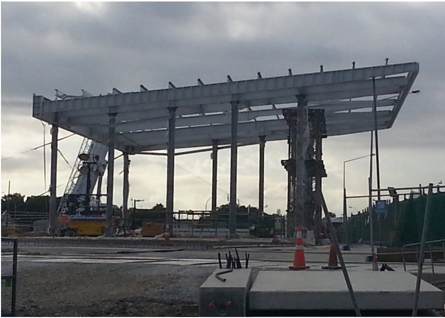
New station taking shape

Further north on platform 2 (the western side), a large canopy is taking shape and stairs to the new Mountain Rd plaza have been installed.