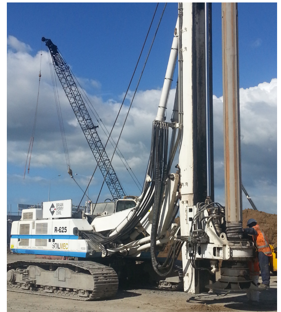
The piling rig starting to be disassembled

The last of the 61 deep piles have been bored to depths of around 55 metres. Concrete foundations are being completed over the piles to support the bridge columns. Then in Easter when trains aren't running, the first of the new bridge beams will be lifted and placed over the railway tracks. Work on the abutments and ramps at each side is progressing well and traffic should be switched over from where it is currently running on the busway bridge around the middle of this year to allow us to complete the busway and open the new station later in the year.