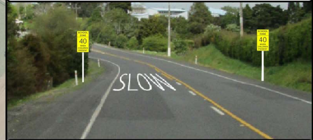
(D) (C) New "40 km/h Advisory" sign located 153m south of Glenbrook Road / Brookside Road intersection.