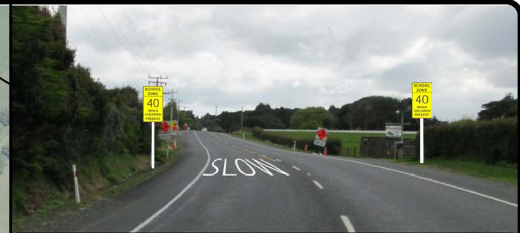
(A) (B) New "40 km/h Advisory" sign located 716m south of Glenbrook Road / Brookside Road intersection.