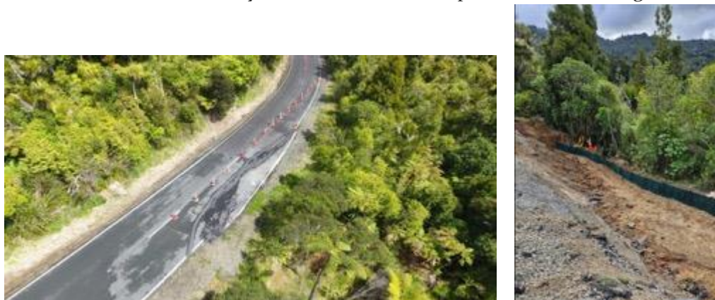
Site from above prior to clearing and enabling works. Excavation works underway.