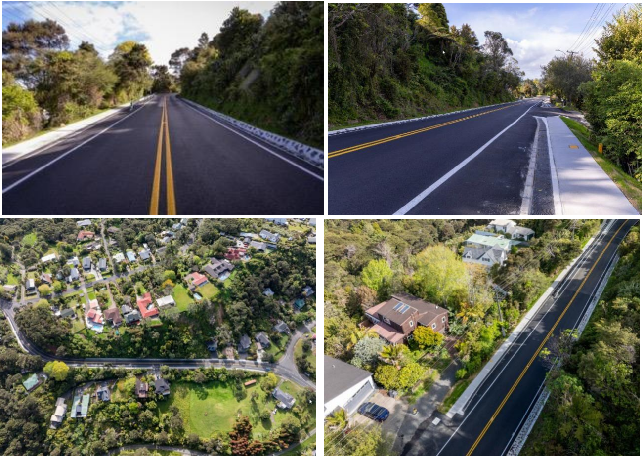
Works on Scenic Drive, North Swanson