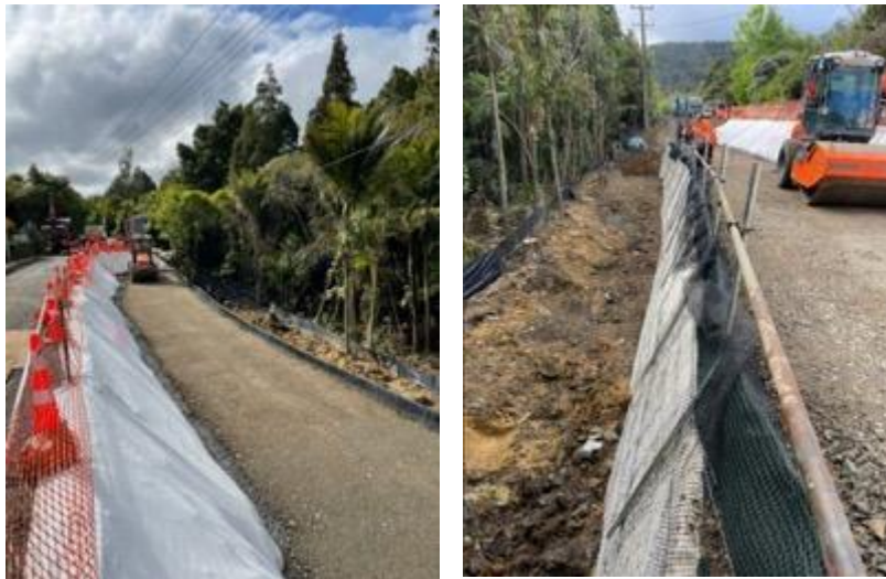
Slip repairs underway on Te Henga Road, temporary sheet pile wall installed central to the picture.