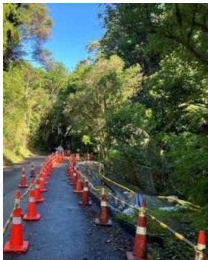
Slip site on Konini Road, Titirangi