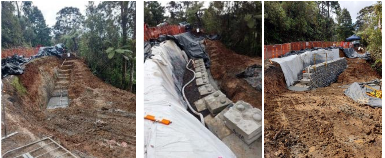
Slip site RPO.582 Karekare Road, installation of the rediblock wall underway in October