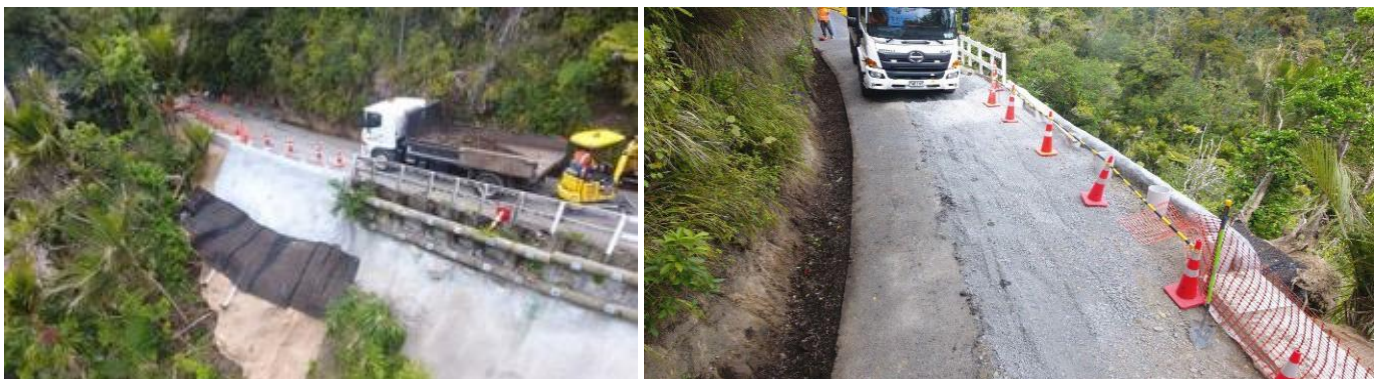
Work at 144 Mountain Road – images show the work underway during October.