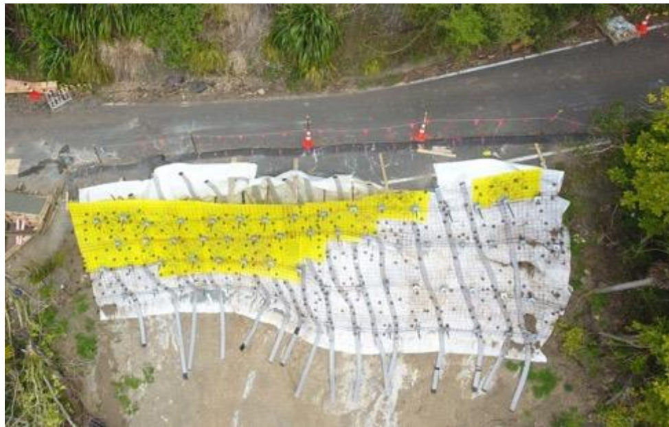
Work on 147 Mountain Road – image shows the soil nailing and mesh on the face of the slip before the shotcreting.