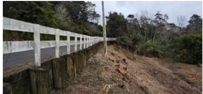
Slip on Simpson Road, outside 163 Simpson Road.