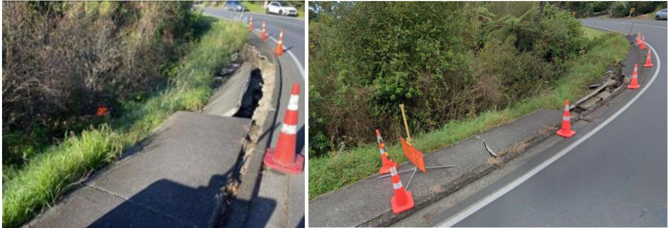
Slip located near 370 Huia Road, this is past the roundabout at Minnehaha/Woodlands Park Intersection, and prior to Victory Road.