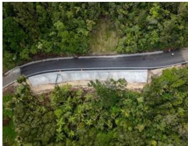
Site completed on Karekare Road, Karekare