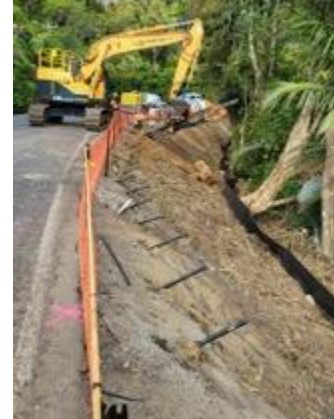
Wairere Road slip site 349 Wairere Road