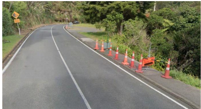
Slip located near 1105 Huia Road