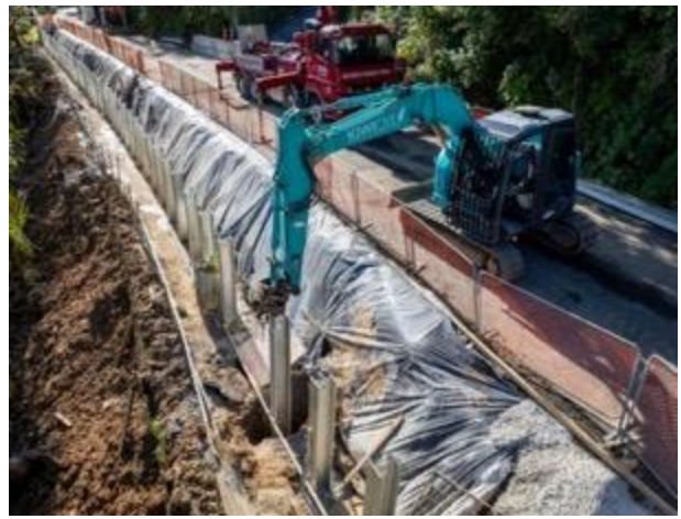
RP0.85 Scenic Drive Titirangi (Piling completed – back filing and drainage underway)

We had earlier completed Rock scaling on the embankment above the road to remove any loose rocks, and hydroseeding of parts of the embankment. The seeding has started to flourish. In October we completed the design for the repair to the embankment overslip at RPo.85, we engaged with the property owners and installed a temporary wall to protect staff working opposite. We have begun the permanent repairs which are programmed to be completed by the end of December, weather dependent. The completion date of this work is late December 2024. The road and the pedestrian access will remain closed until then.