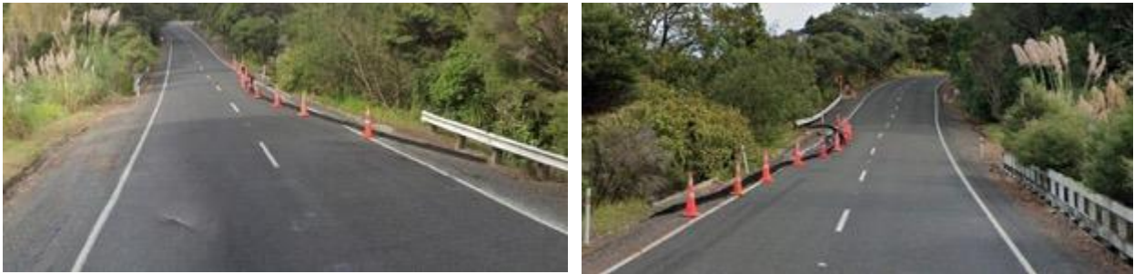
Site RP12.55, currently there are retaining walls on each side of the road, large upstream catchment and existing stream.