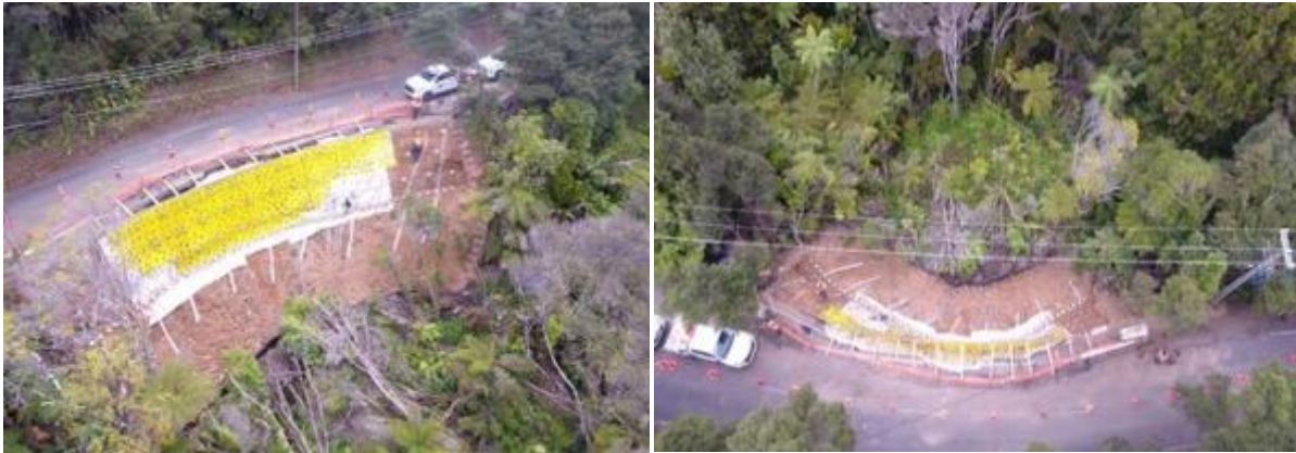
Work at 94 Mountain Road – images show the slope works which include soil nailing, grouting and mesh, before the shotcrete was applied.