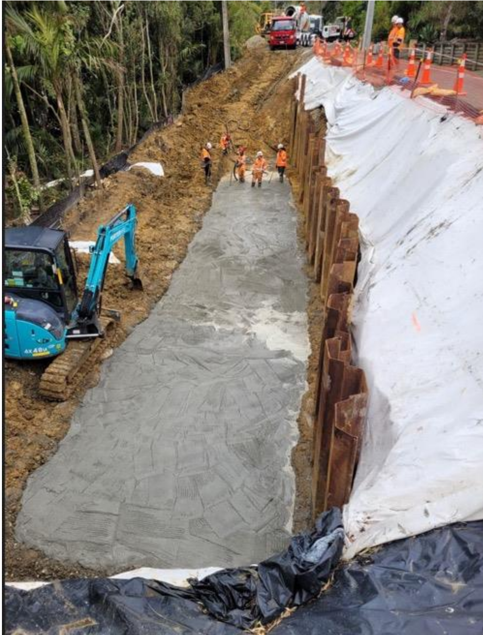
Te Henga Road