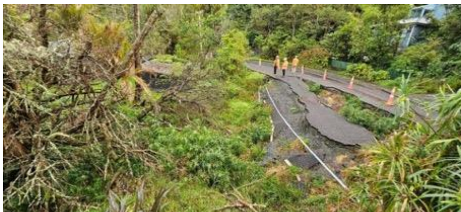
The block wall, and the road open, along with a before photo of the slip.