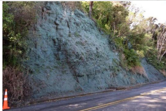
Scenic Drive Titirangi – Images show the embankment after the seeding, and then again after the seeding has grown.