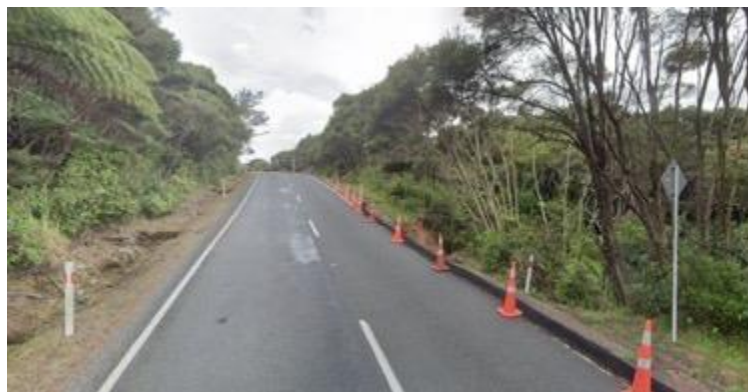
Slip located approx. 100m past Cornwallis Road intersection.