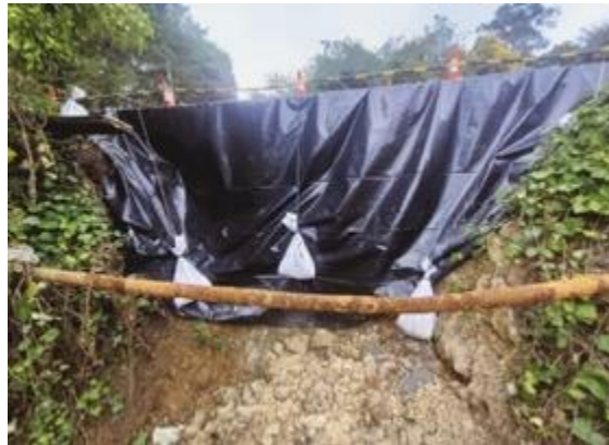
Slip located near 634 Huia Road