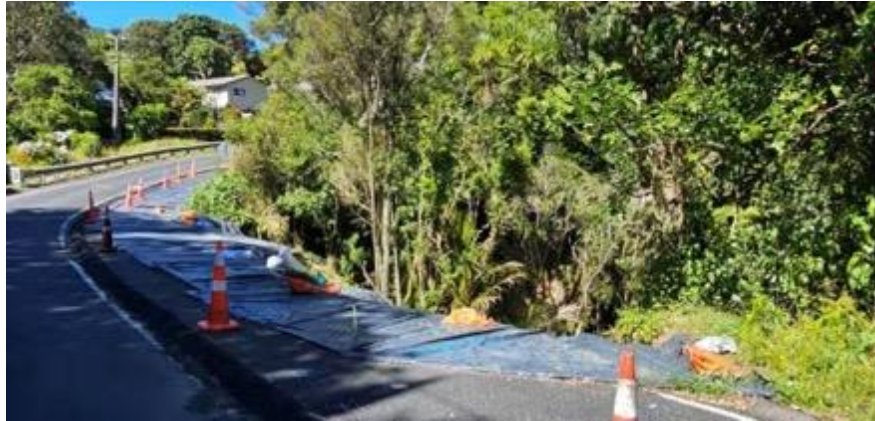
Woodlands Park Road Slip Site