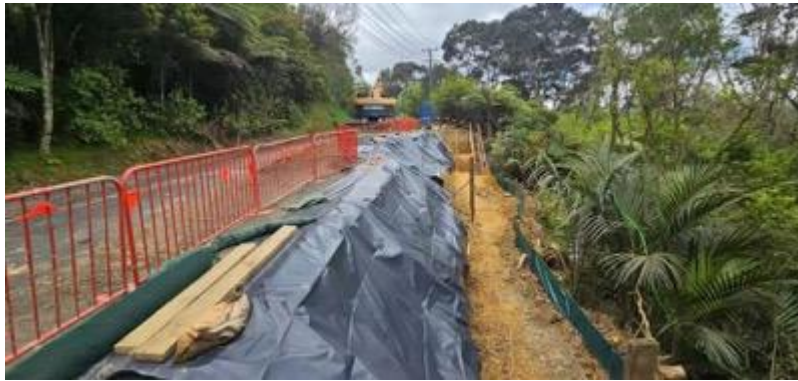
Slip site on Kellys Road Oratia, works underway in October 2024.