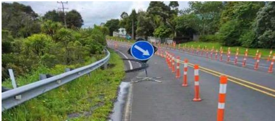
West Coast Road, Oratia slip site, located between Parker Road and Carter Road.