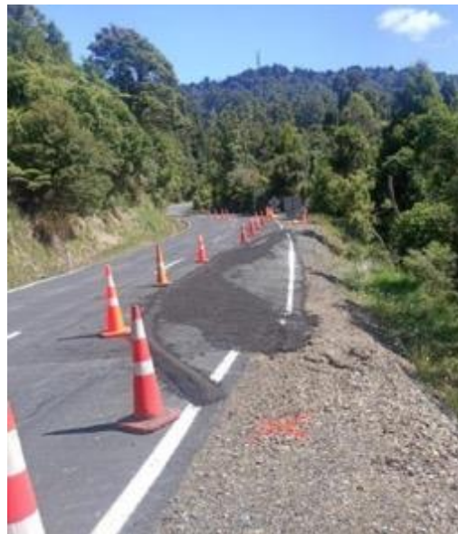
Site ready to start works once the large site at RP8.25 is complete, and access from the North side of the slip is open.

Design is complete and construction is programmed to start in September after the site at RP8.25 is completed, and the road is opened at that location. This site will require a full road closure, with access only to residents. Residents on the Waiatarua side of the closure will need to change their access route to West Coast Road.