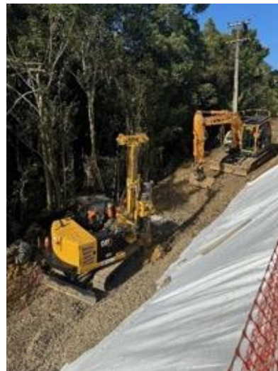
Slip repairs underway on Te Henga Road, Piling works starting