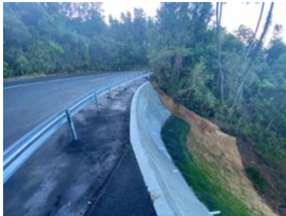
Scenic Drive, Auckland City Look-out slip repair, soil nail wall complete.