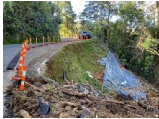
Slip site RPo.582 Karekare Road