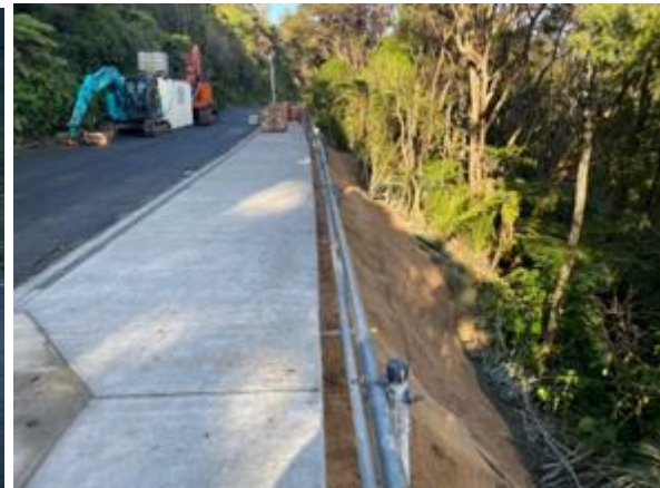
RP0.90 Scenic Drive Titirangi (Balustrade to be completed.)