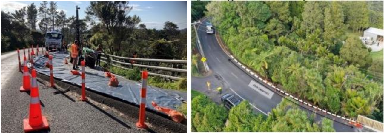
Wairere Road slip site 349 Wairere Road