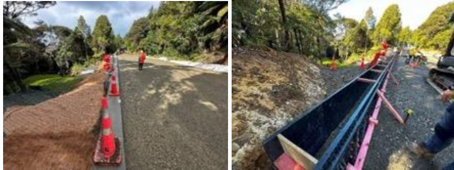
Works progressing, ready to lay the road, matting and seeding complete. The retaining wall is completed with the edge beam being installed in August.