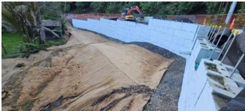
Block retaining wall almost completed on Takahe Road