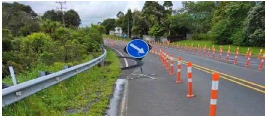
West Coast Road, Oratia slip site.