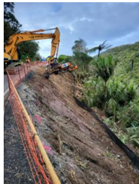
Site underway on Karekare Road, Karekare