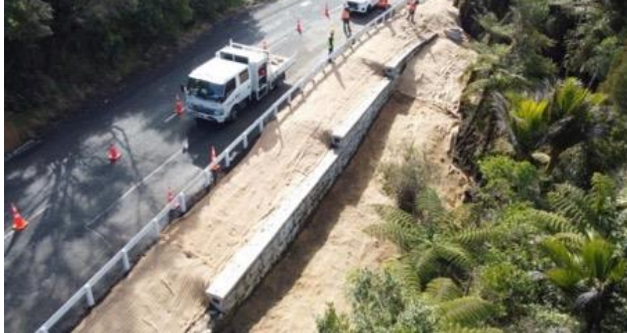
Block retaining wall completed, seeding and matting has been done and we expect to see the grass growing through soon.