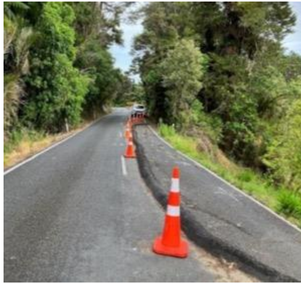
Site ready to start works once the large site at RP8.25 is complete.

RP 6.58 SCENIC DRIVE, BETWEEN ARATAKI AND WEST COAST ROAD: Design is nearing completion on the concrete piled tied back wall. We are programmed to start construction in October. This repair will require full road closures, with access only to residents.