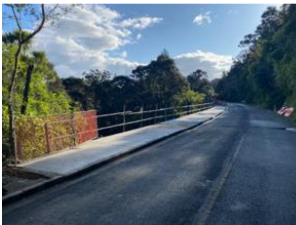
RP0.75 Scenic Drive Titirangi (Balustrade to be completed.)