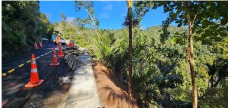
Work on Mountain Road – image shows the narrow nature of Mountain Road, works underway on two sites next to each other.