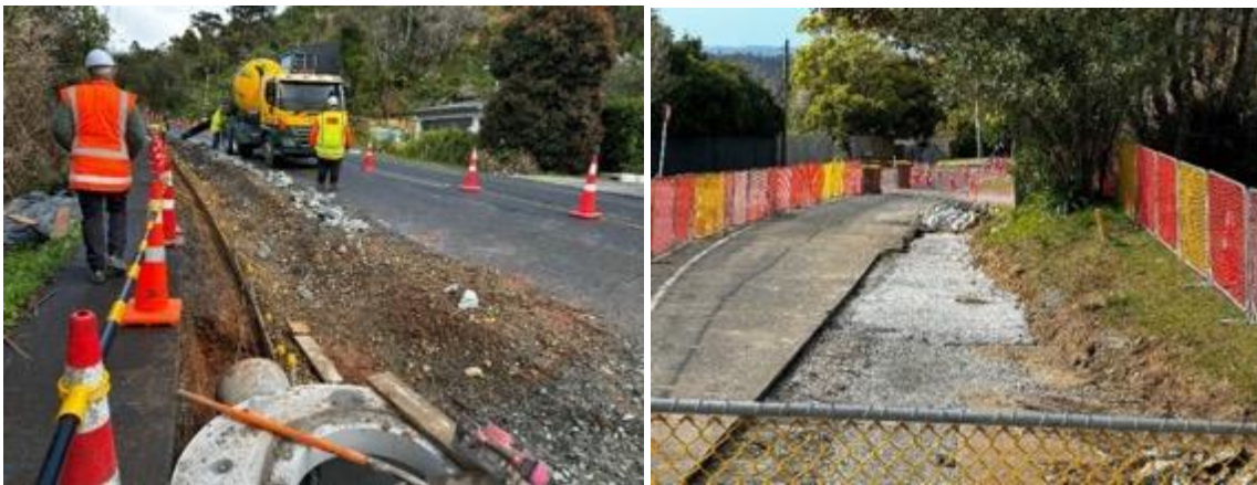
Works on Scenic Drive, North Swanson

This will be completed under stop/go traffic management and one lane will be open at most times. There may be a time when the road will be closed in short periods of up to 15mins if required. This repair work is expected to be completed Mid- September 2024. There has also been long term monitoring of the bore holes to monitor any further movement.