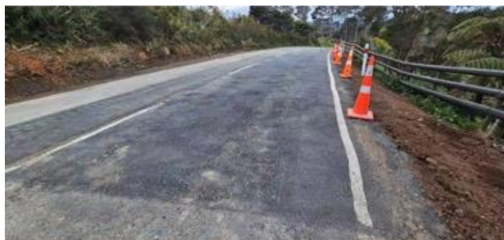
Repaired pavement on Wairere Road, at Rooster Ridge.