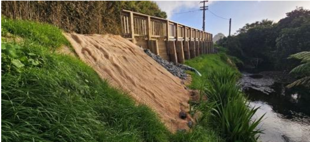
Slip repair on Glenesk Road