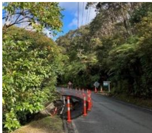
Slip site on Kellys Road Oratia, note the overhead powerlines.