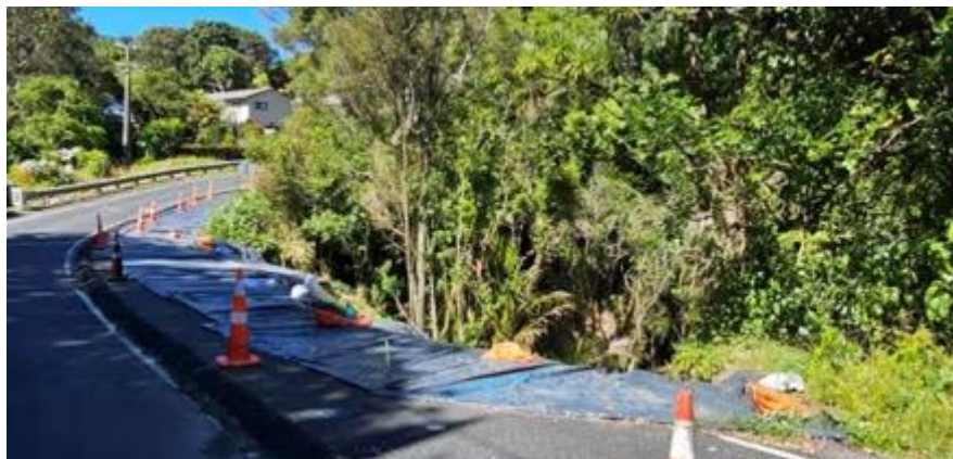
Woodlands Park Road Slip Site