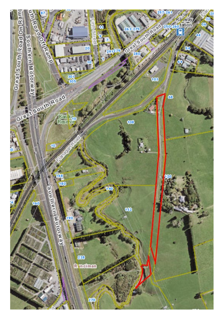
Road proposed to be stopped indicated with red outline (AC GeoMaps)