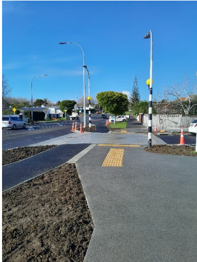
Garnet Road / Westmere Crescent