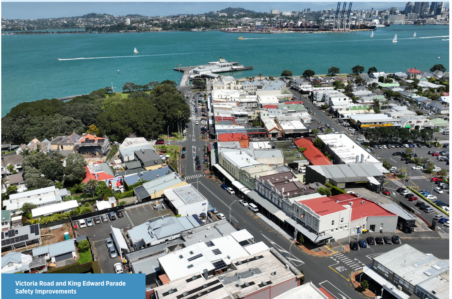
Victoria Road and King Edward Parade Safety Improvements